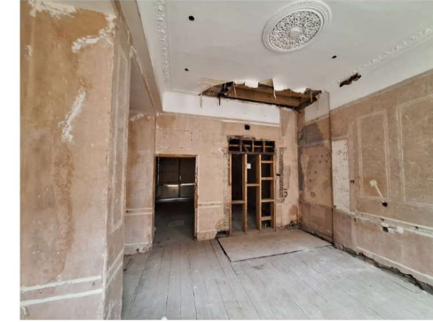
building 06 - front

due to remaining historic ceiling and cornice, and requirement to achieve compliance with Part B of Building Regs, a new fire compartment ceiling has to be installed at a height below the retained coving - negating a meaningful gap above the bathroom pod as can be achieved in the pod rooms at the rear of Buildings 4 and 5.