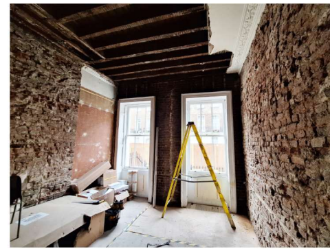
building 05 - front