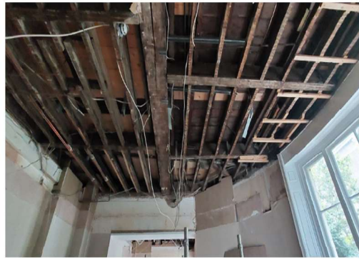
building 04 - rear