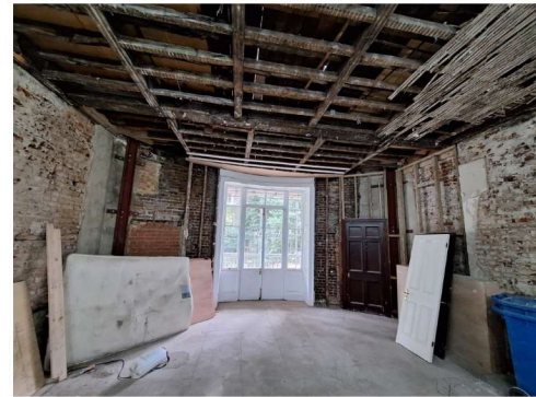
building 05 - rear