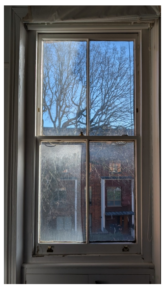
Bedroom 1 W14 (see drawing file #09)