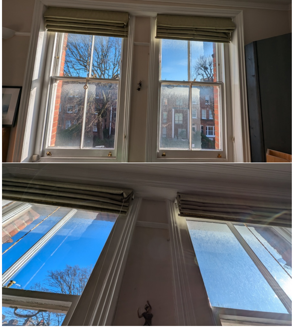
Bedroom 3 W17, W18 (see drawing file #12)