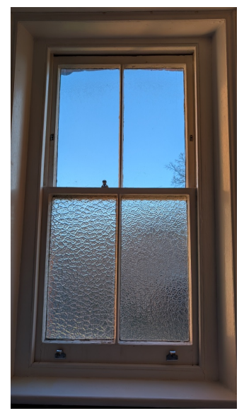
Bathroom W16 (see drawing file #11)