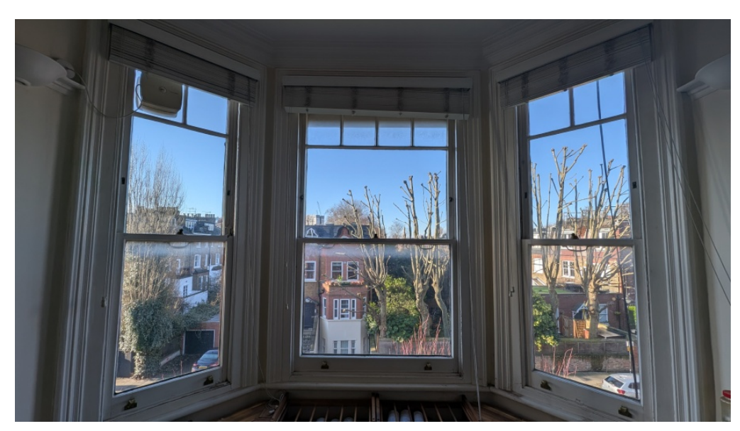
Kitchen bay W6, W7, W8 (see drawing files #03 & #04)