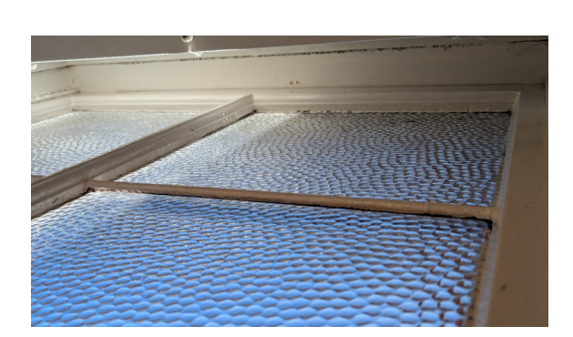
metal bar across existing outer sash to interior only