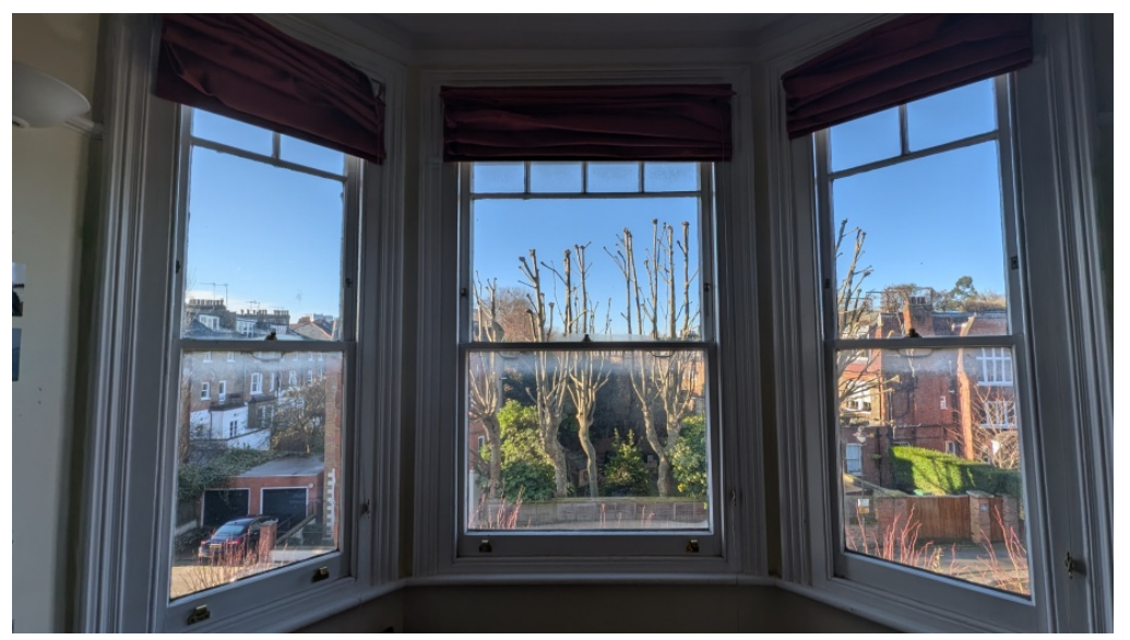
Bedroom 2 bay W9, W10, W11 (see drawing files #05 & #06)