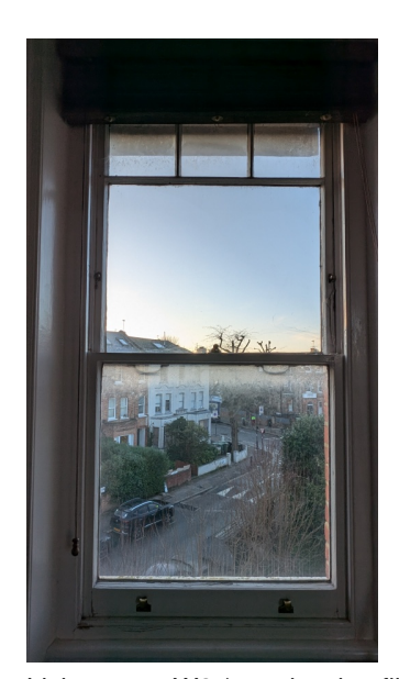
Living room W2 (see drawing file #01)