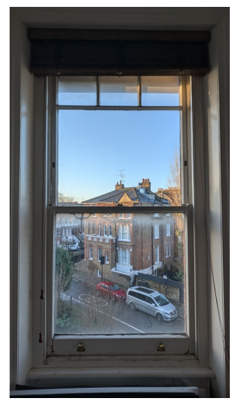
Living room W3 (see drawing file #01)