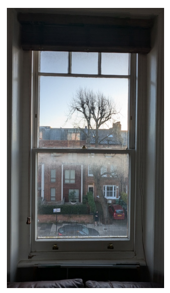
Living room W1 (see drawing file #01)