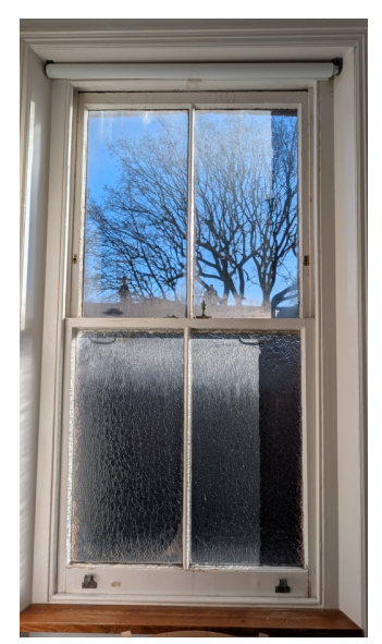
En-suite Shower W12 (see drawing file #07)