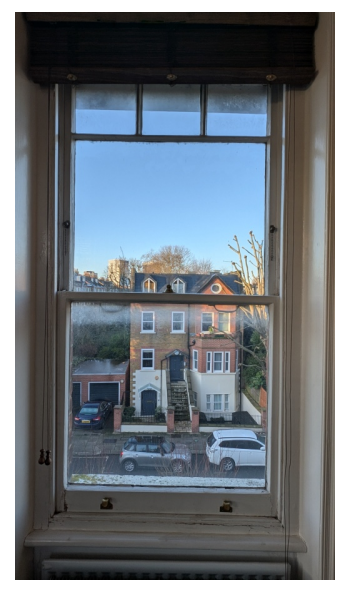
Living room W4 (see drawing file #01)