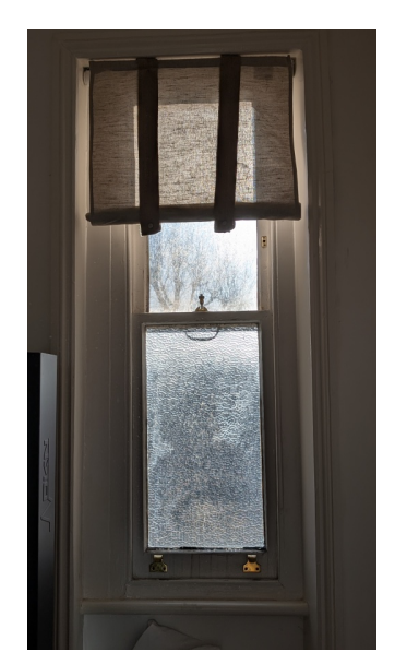
Dressing room W13 (see drawing file #08)