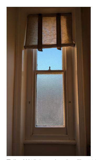
Toilet W15 (see drawing file #10)