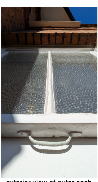
exterior view of outer sash