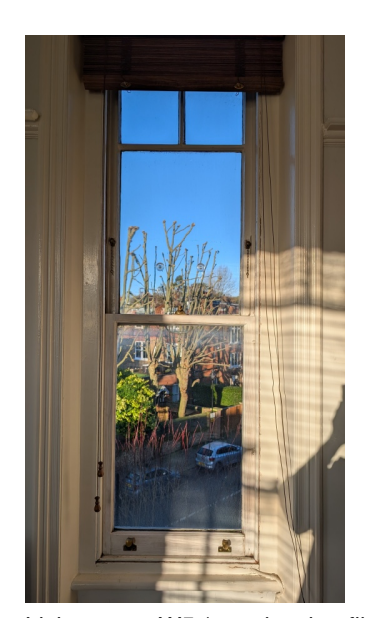
Living room W5 (see drawing file #02)