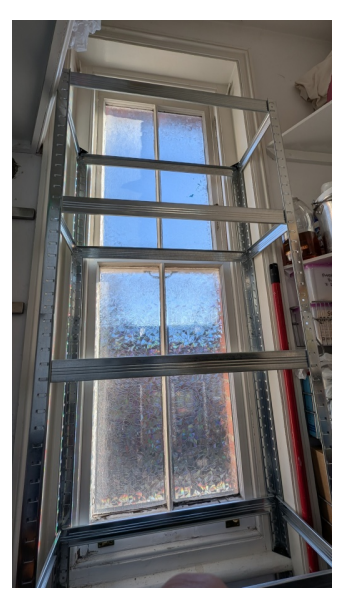
Cupboard W20 (see drawing file #14)