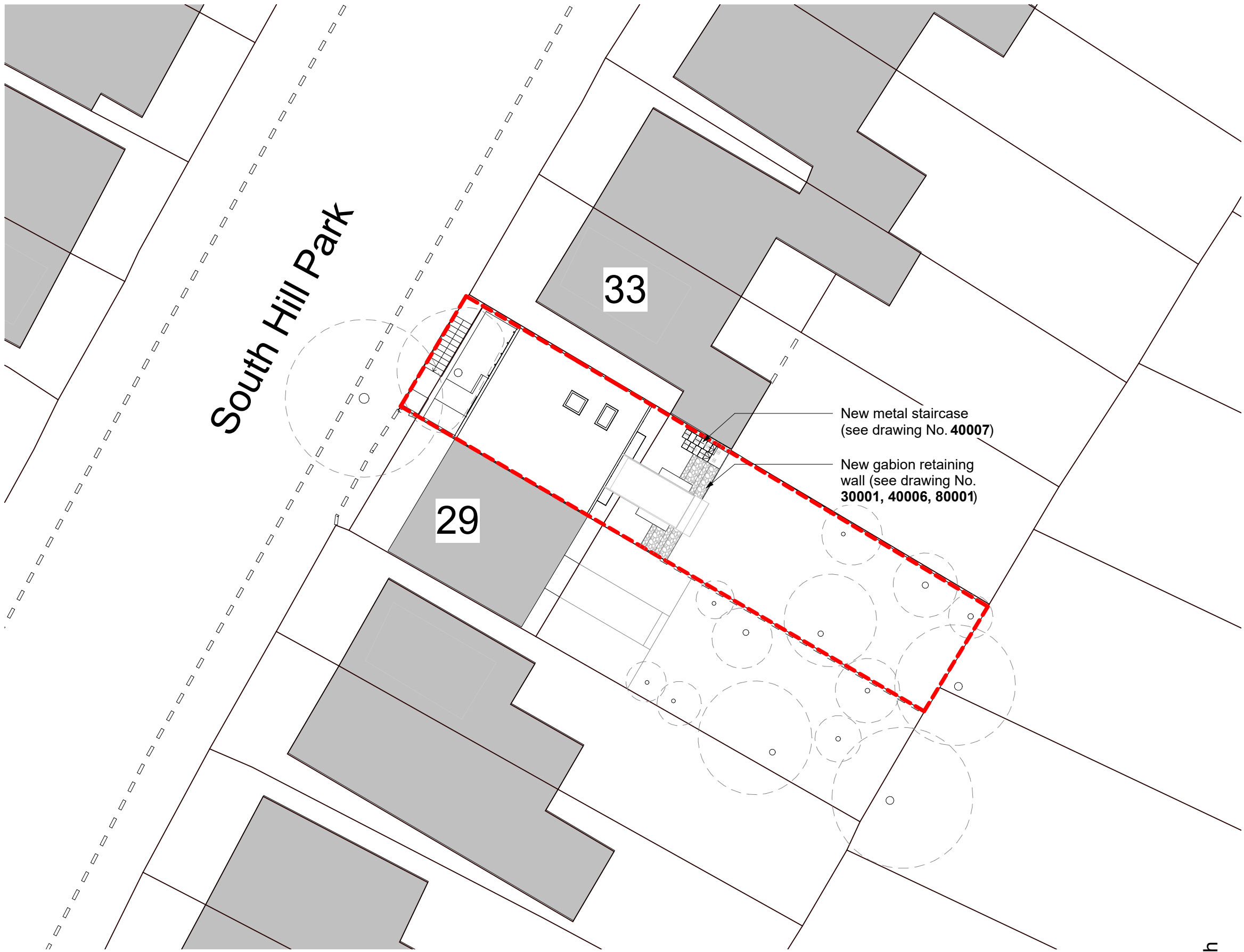
Proposed Site Plan 1 : 200

Drawing Notes 1. Do not scale this drawing. 2. All dimensions must be checked on site and any discrepancies verified with the Architect. 3. Unless shown otherwise, all dimensions are to structural surfaces. 4. All work must comply with relevant building Standards and Building Regulations requirements. Drawing errors and omissions to be reported to the Architect.