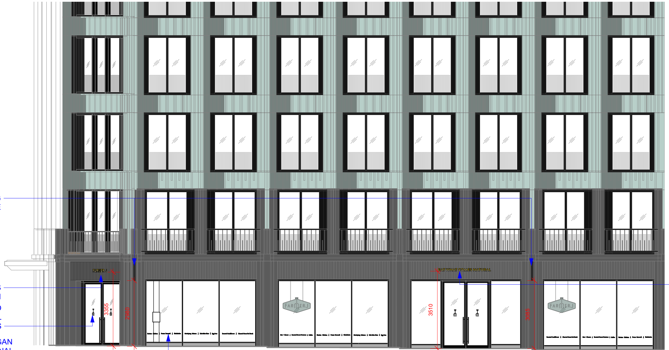
2 Proposed West Elevation Scale: 1:100

AD APPLICATION SITE ADDRESS 237-247 TOTTENHAM COURT ROAD, LONDON, W1T 1QS