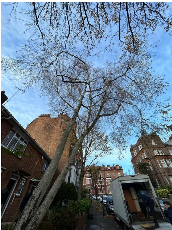
T1: Silver birch