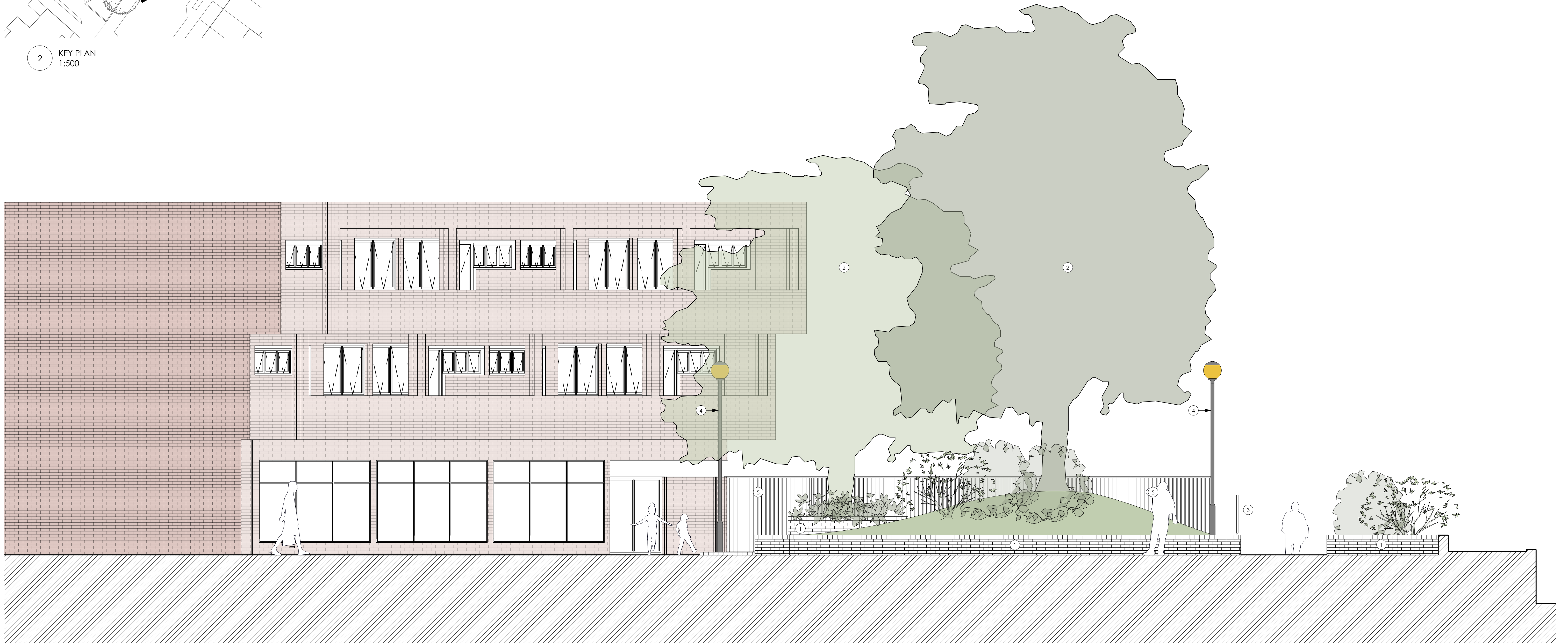
1 PROPOSED SITE ELEVATION B 1:50