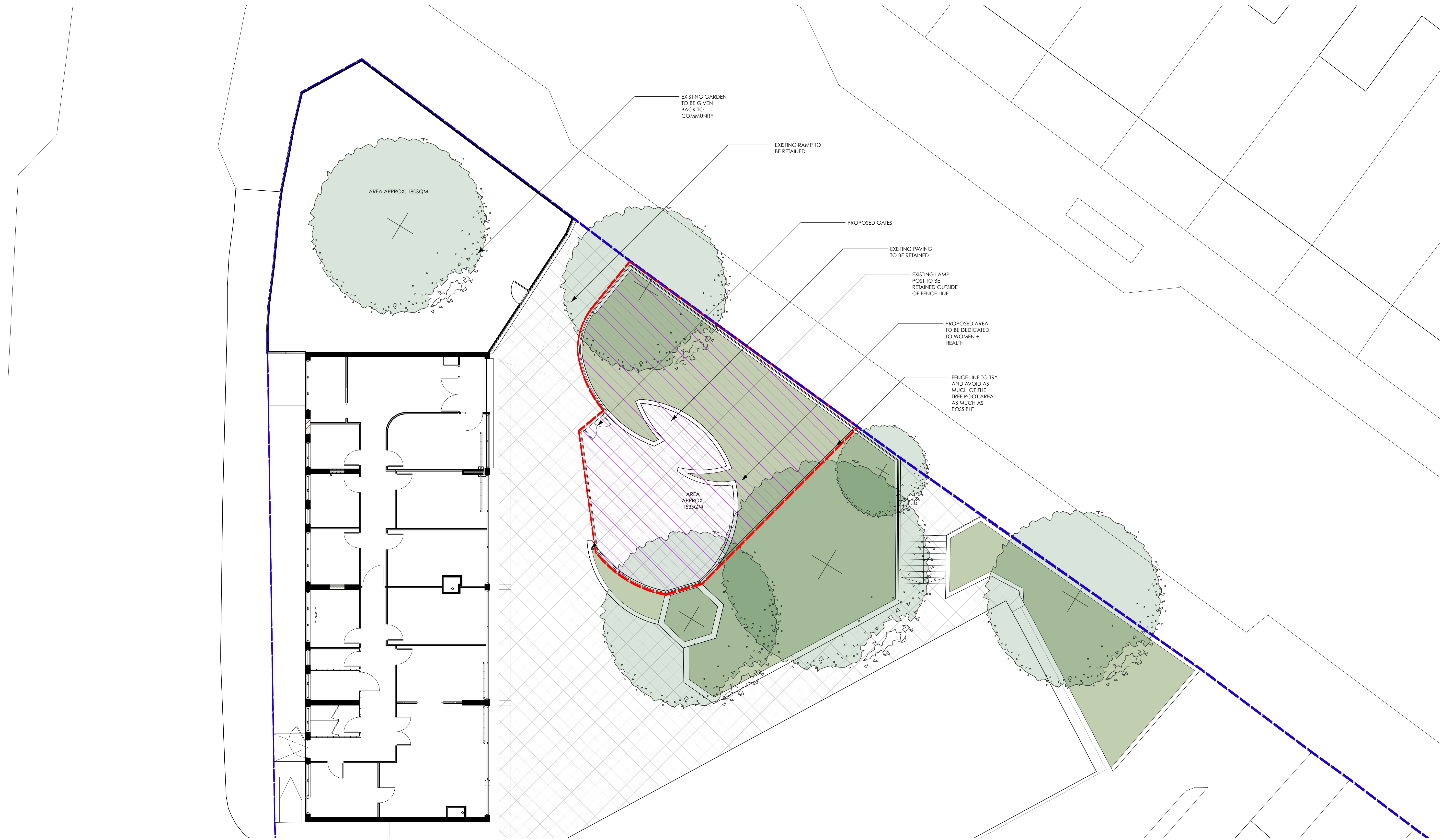
1 PROPOSED PLAN 1:100