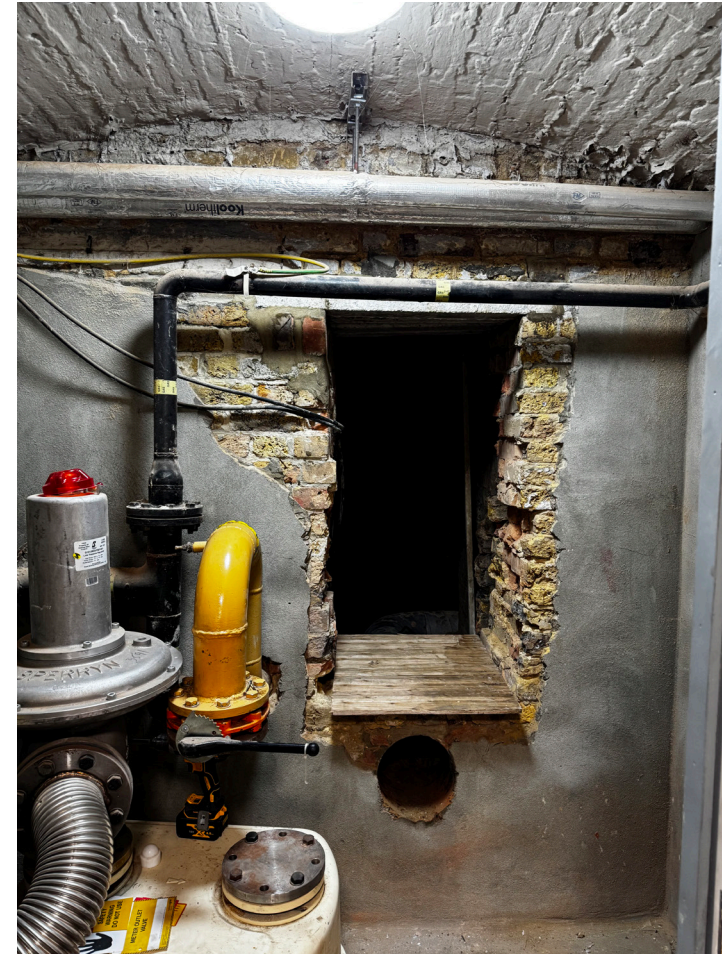
Photograph 1: of aperture made in Gas room wall, with gas meter to the left.

103 WAC Arts building has three parts. Including a grade II listed Old Town Hall, owned by Camden Council. These proposals are not visible from any public areas of any part of the building, new or old.