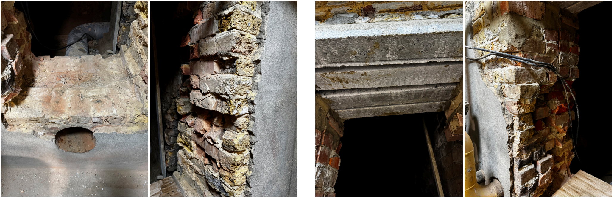
Photographs of aperture made in Gas room wall.