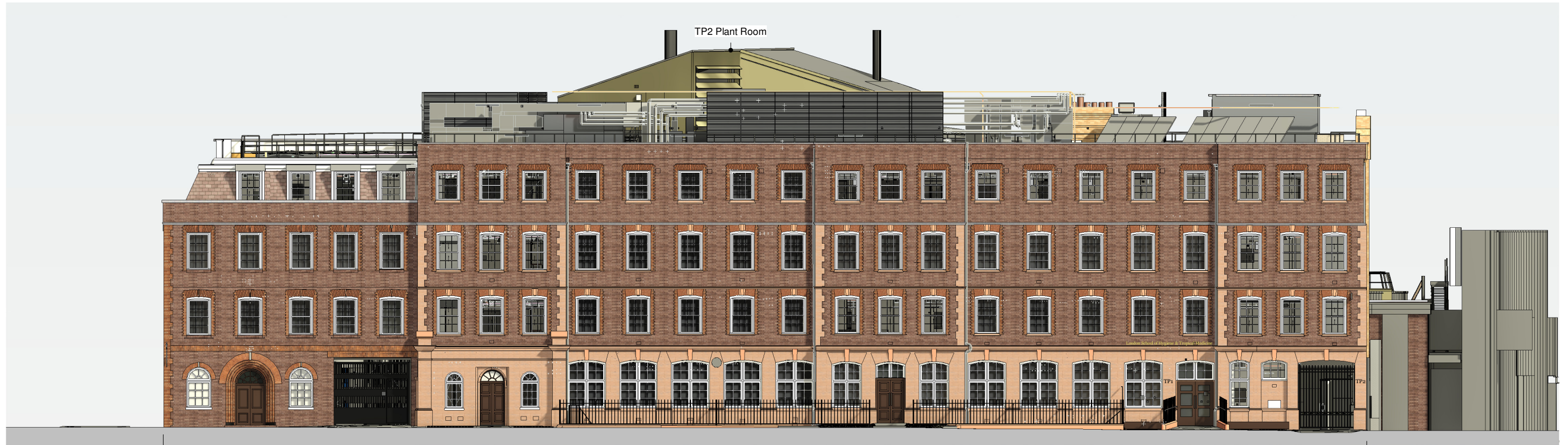
LSHTM TP1 Tavistock 15-17