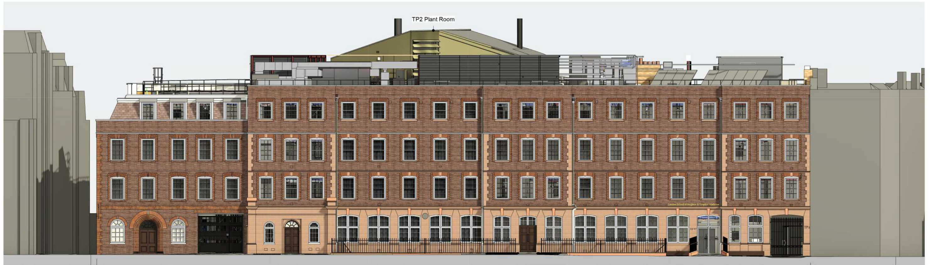
LSHTM TP1 Tavistock 15-17