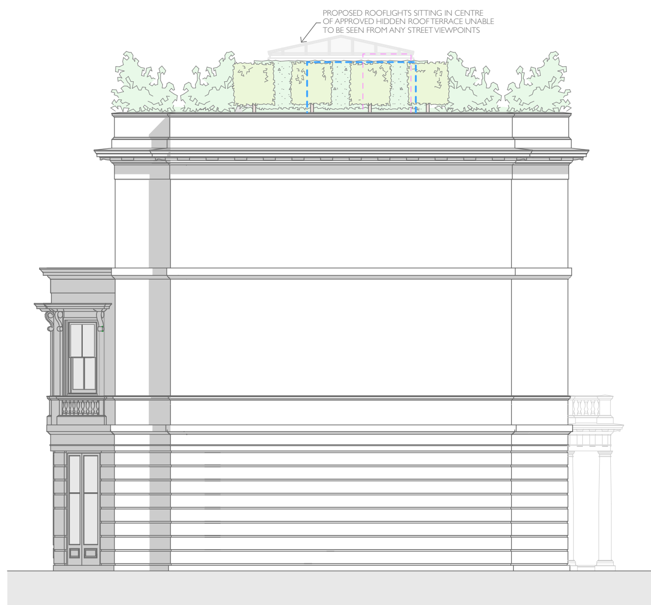
ELEVATION 3 WITH APPROVED PLANTING