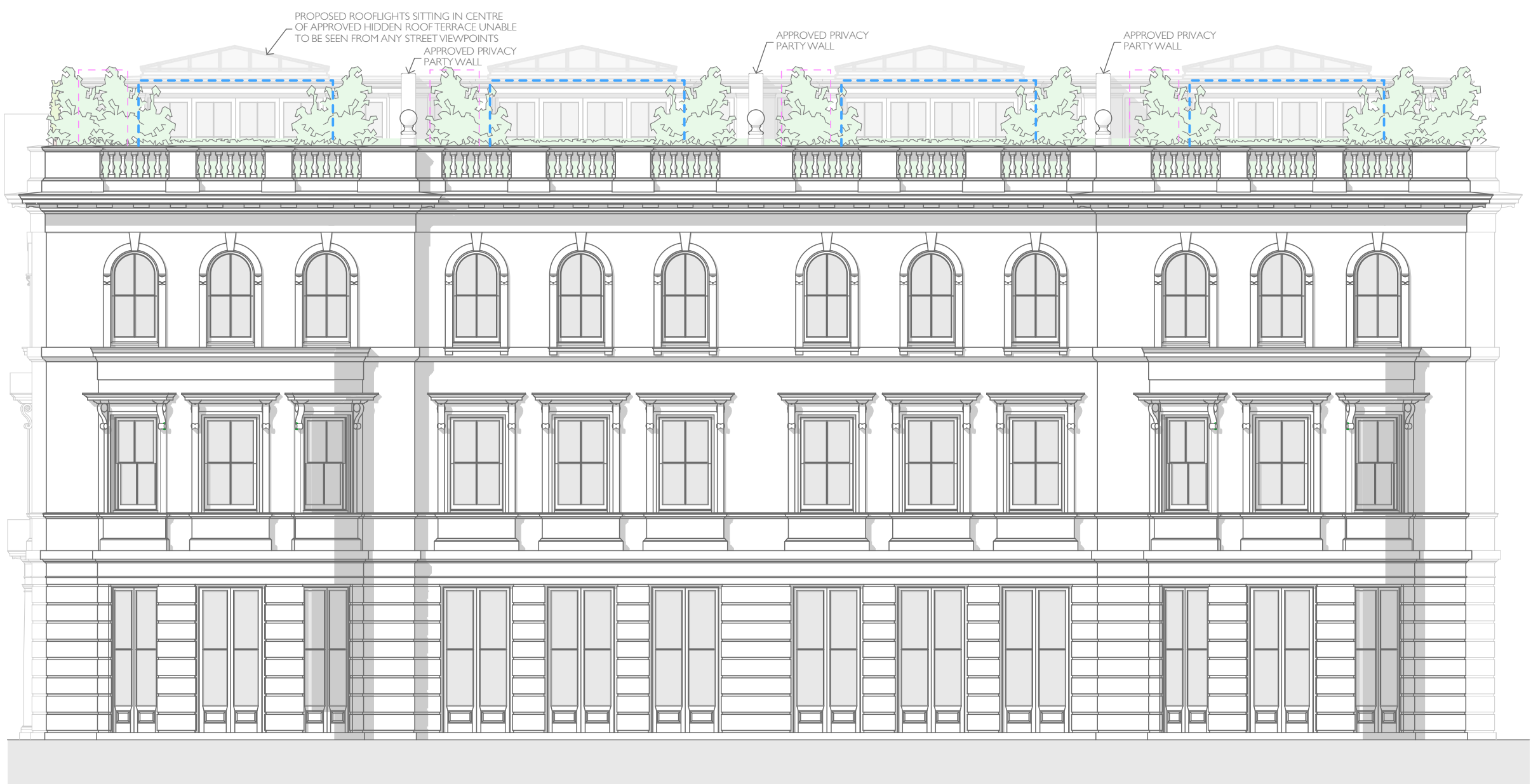
ELEVATION 4 WITH APPROVED PLANTING