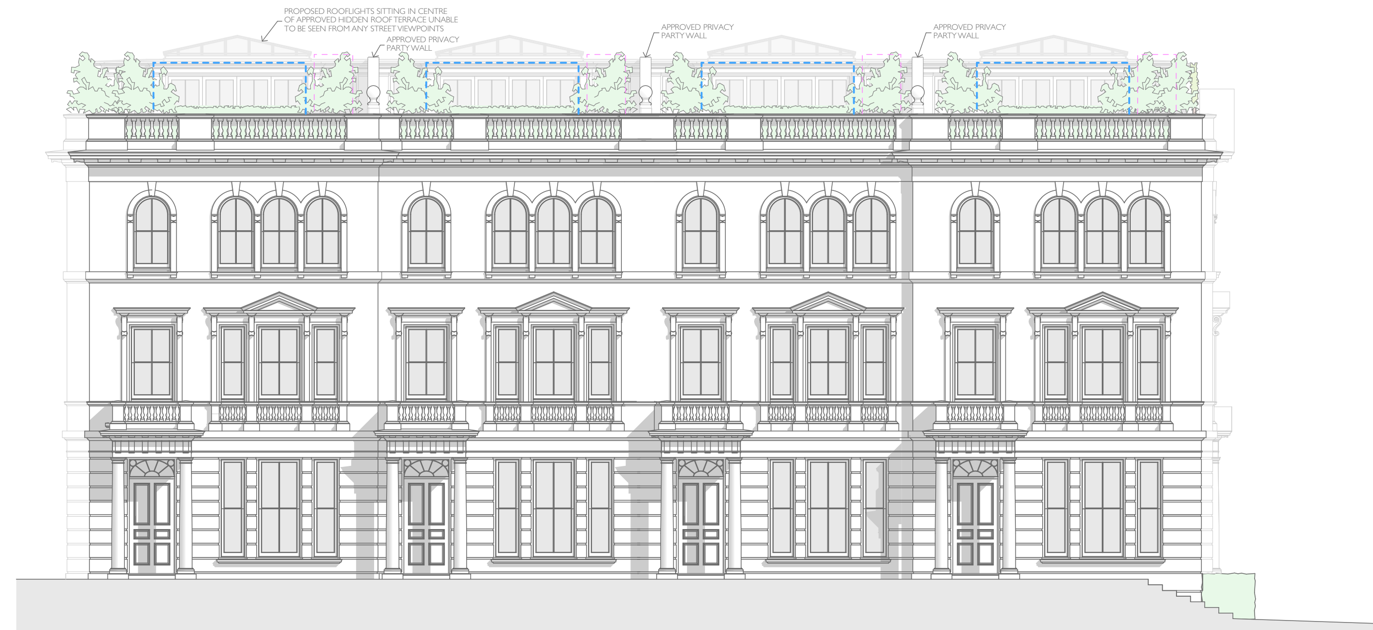
ELEVATION 2 WITH APPROVED PLANTING