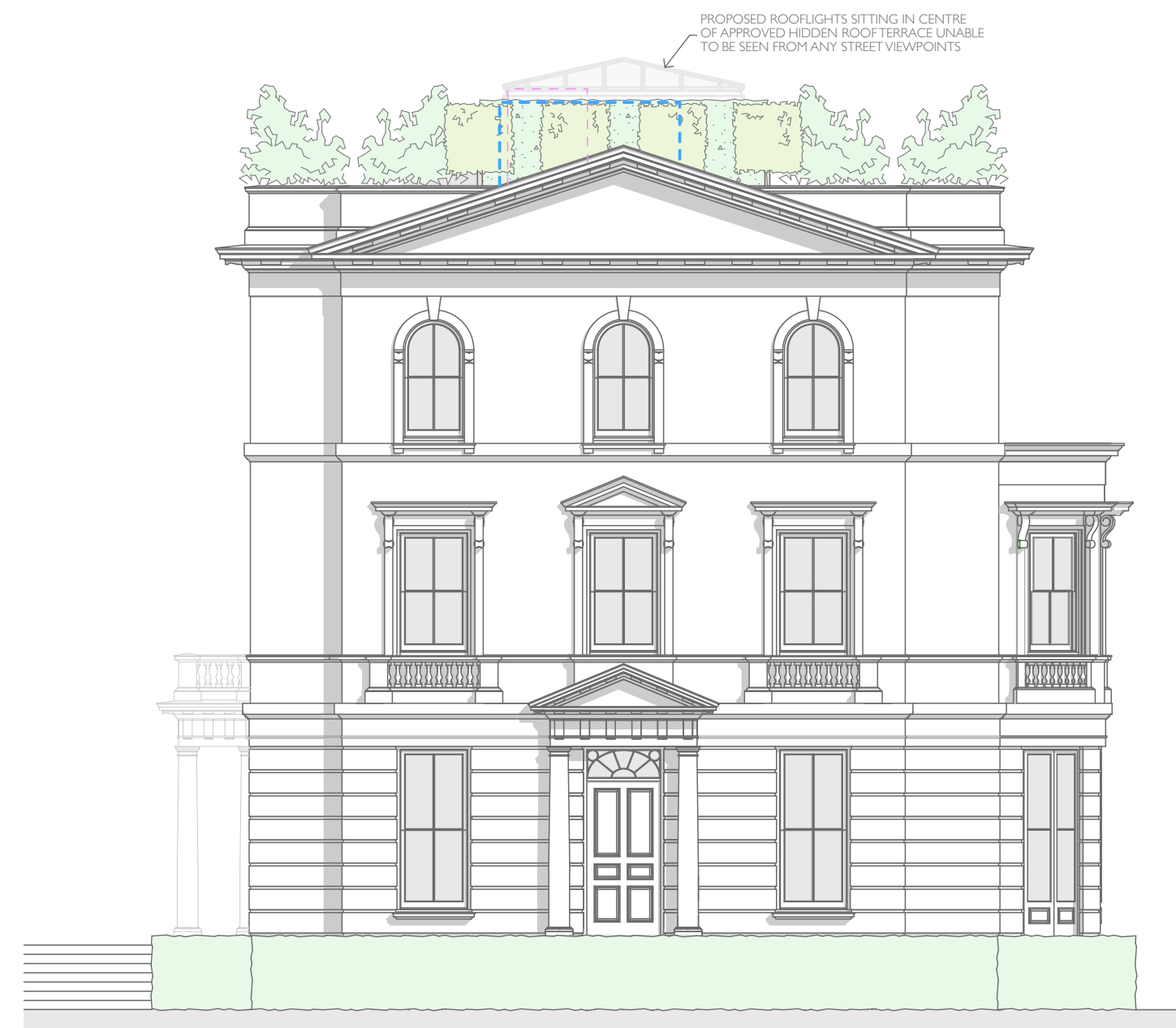
ELEVATION 1 WITH APPROVED PLANTING

----- APPROVED LIFT ACCESS, MID TERRACE, UNSEEN FROM ANY STREET VIEW