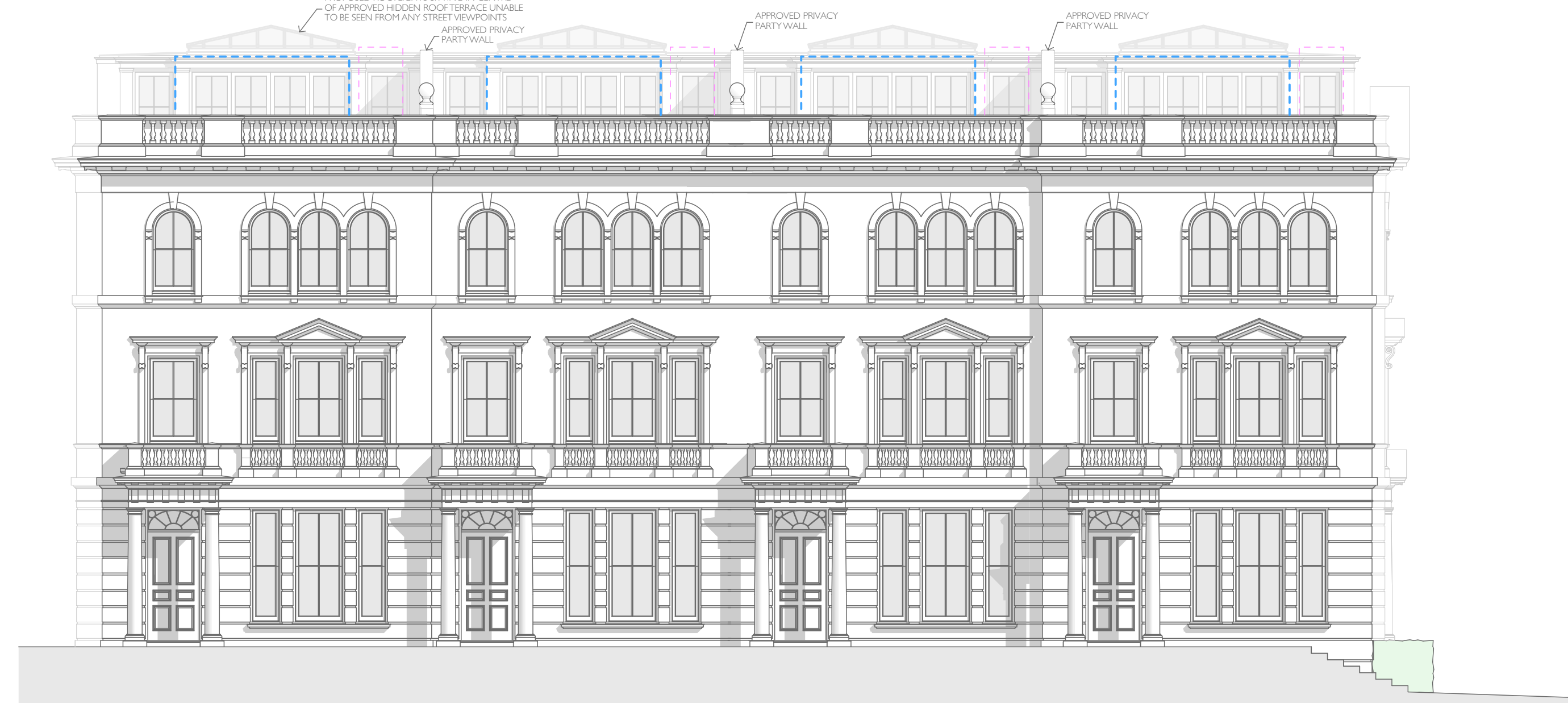
ELEVATION 2 WITHOUT APPROVED PLANTING