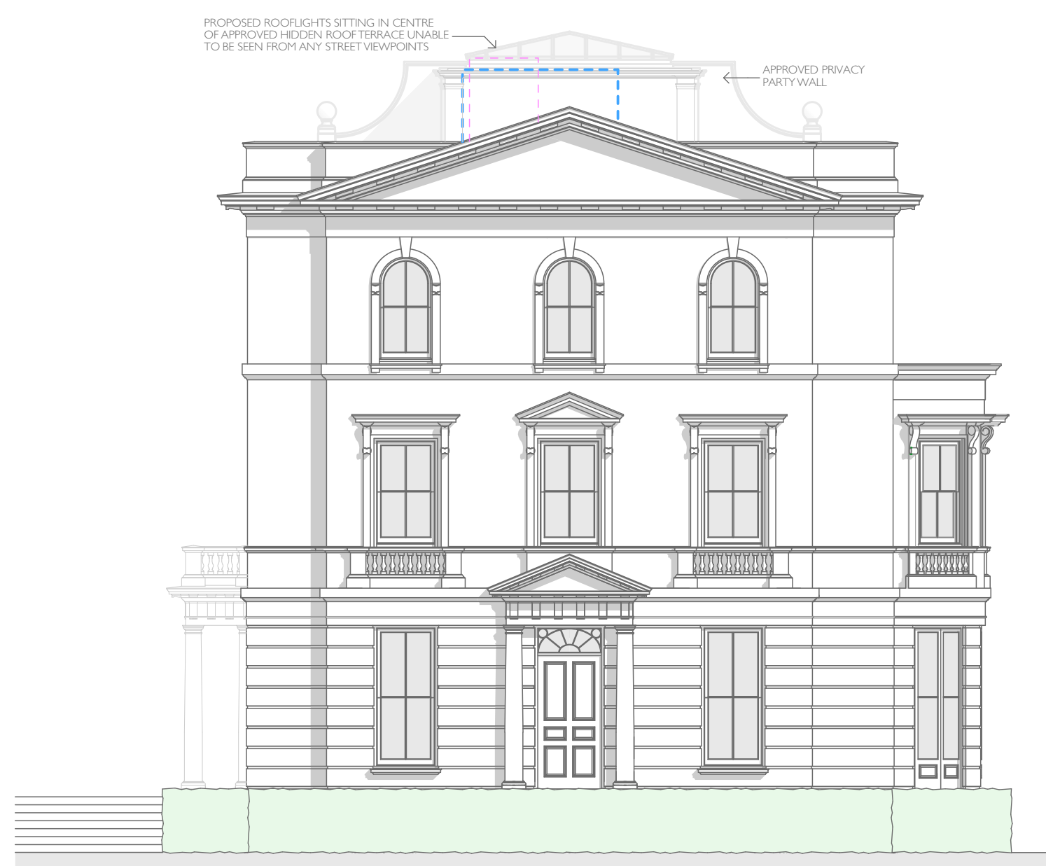
ELEVATION 1 WITHOUT APPROVED PLANTING