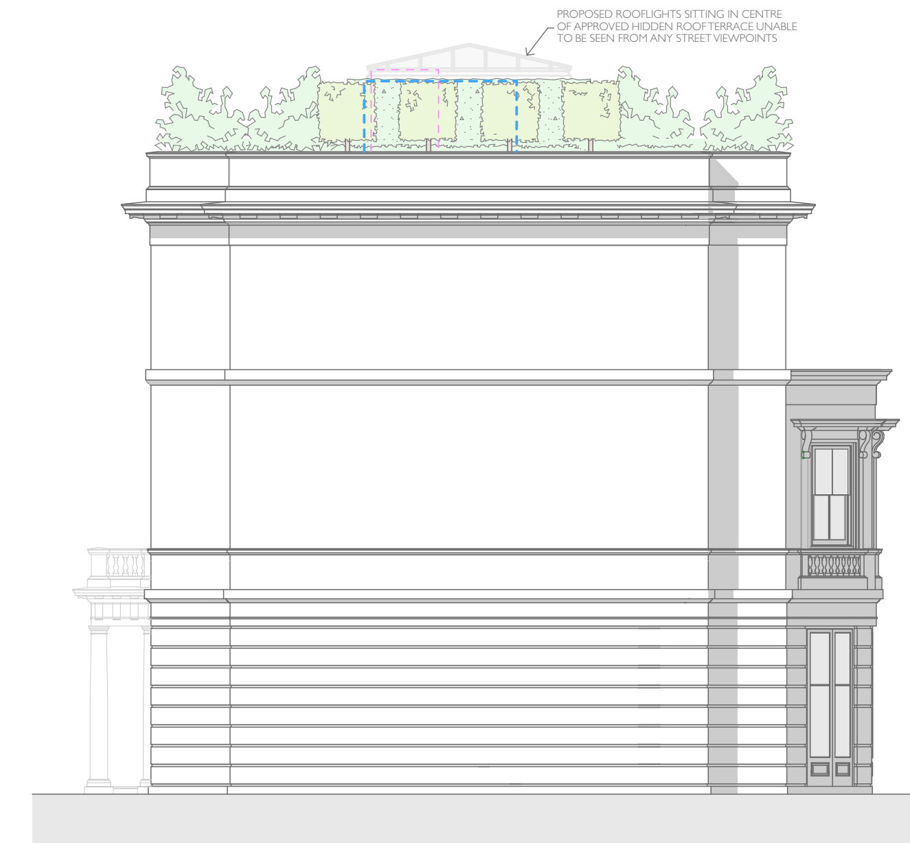
ELEVATION 4 WITH APPROVED PLANTING