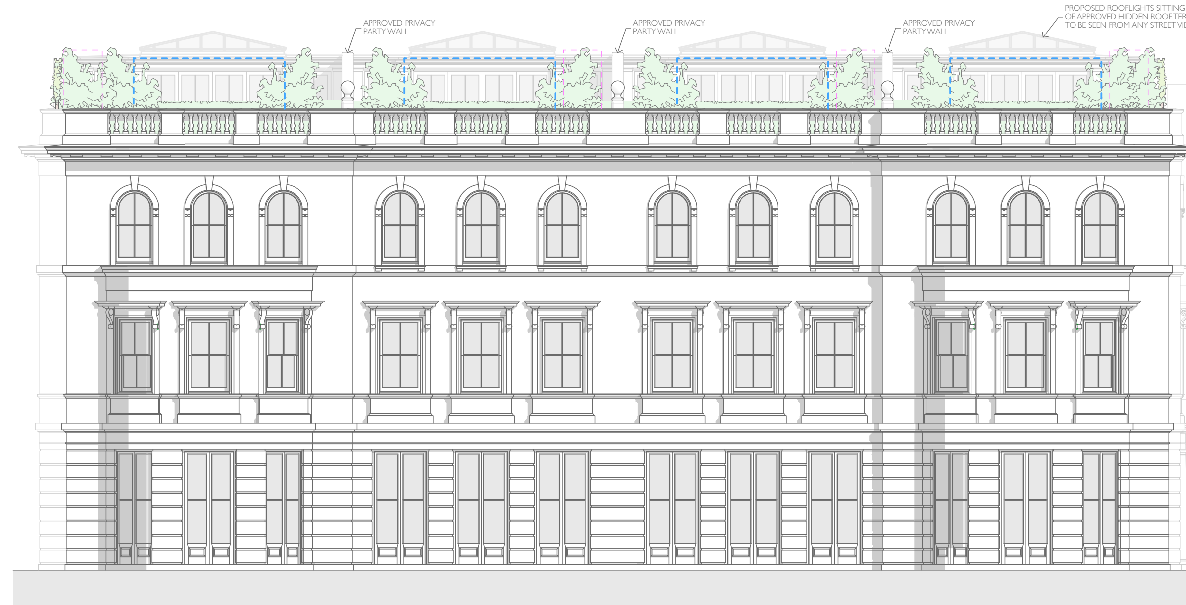
ELEVATION 3 WITH APPROVED PLANTING

----- APPROVED LIFT ACCESS, MID TERRACE, UNSEEN FROM ANY STREET VIEW