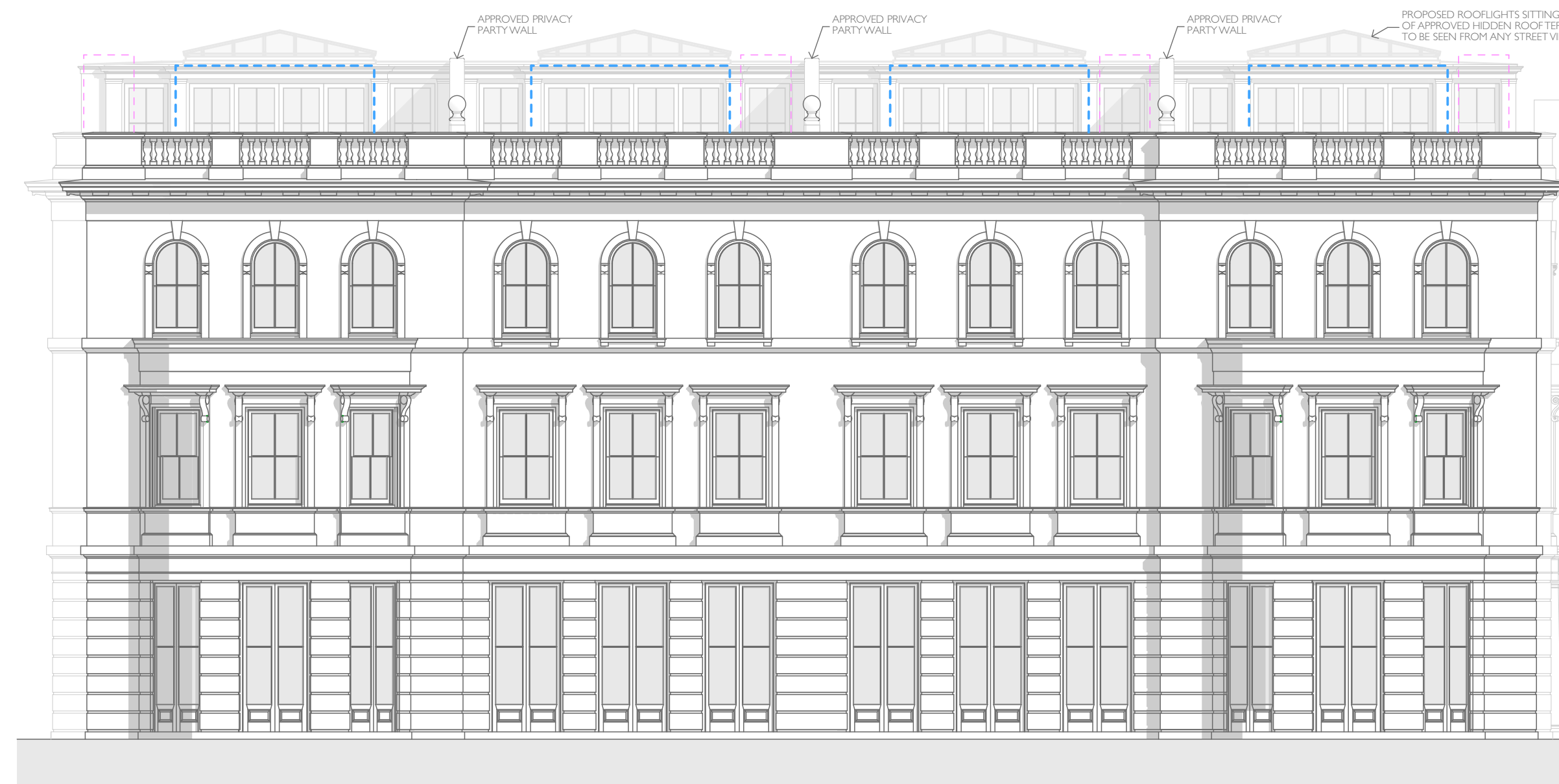
ELEVATION 3 WITHOUT APPROVED PLANTING