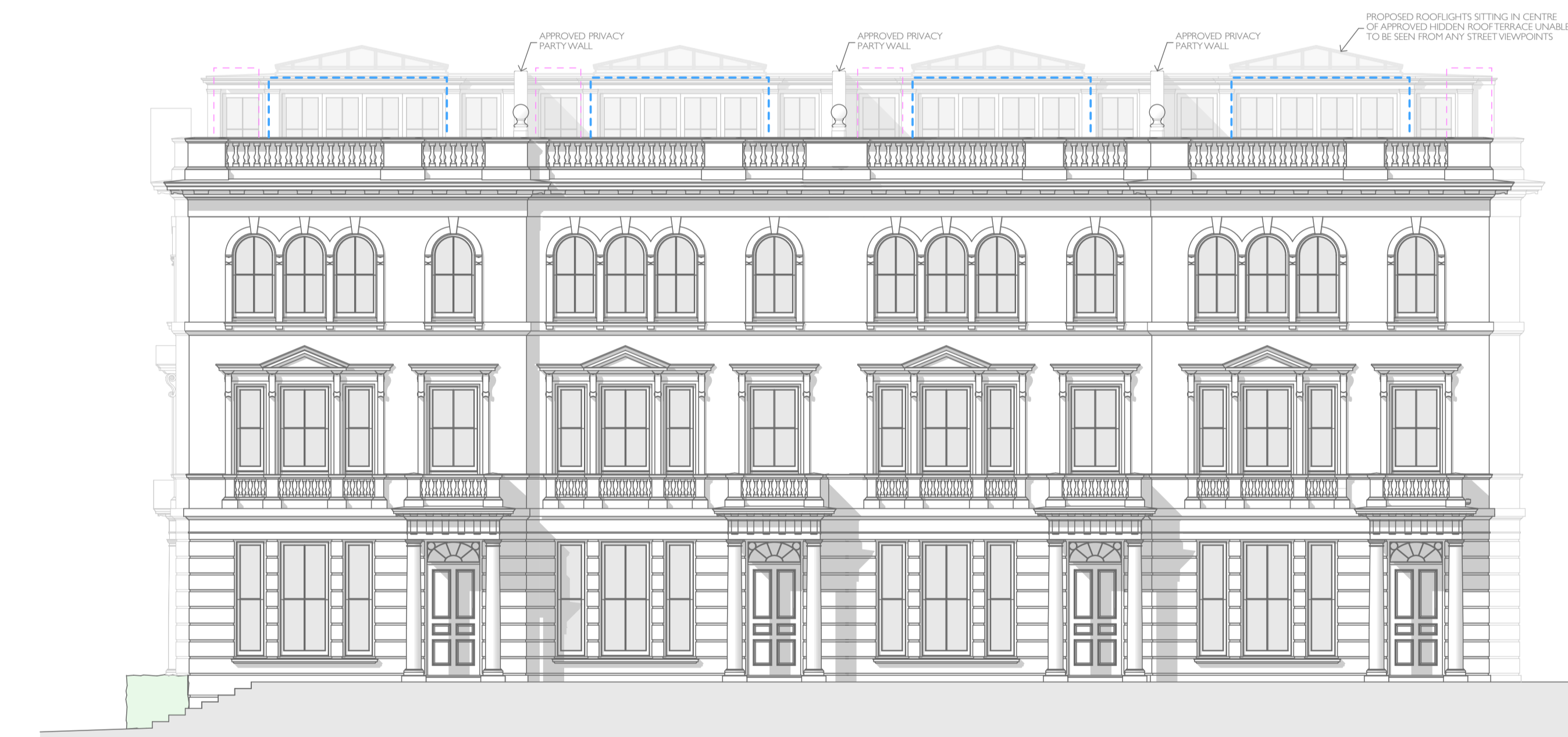
ELEVATION 1 WITHOUT APPROVED PLANTING