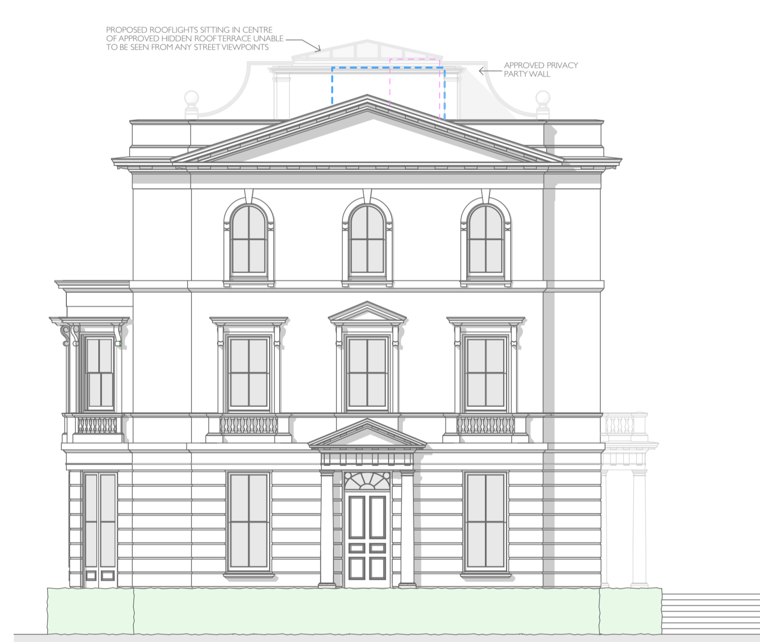
ELEVATION 2 WITHOUT APPROVED PLANTING