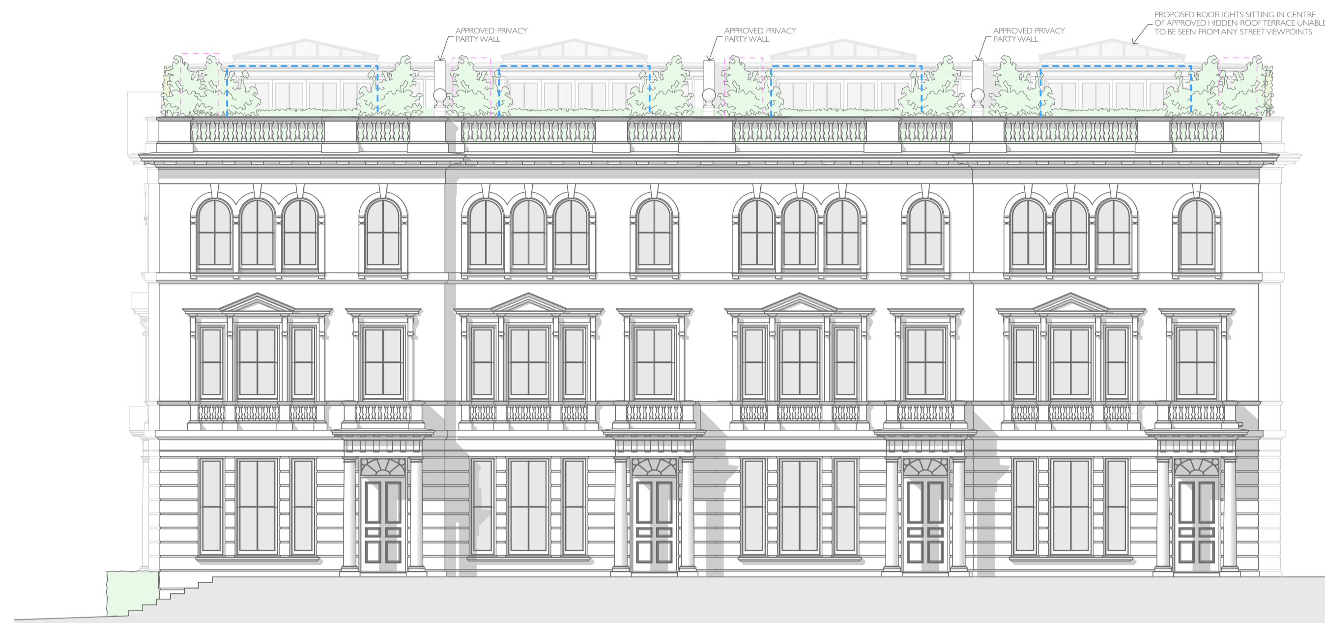
ELEVATION 1 WITH APPROVED PLANTING 0 2 4 6 8 10M

--- APPROVED LIFT ACCESS, MID TERRACE, UNSEEN FROM ANY STREET VIEW