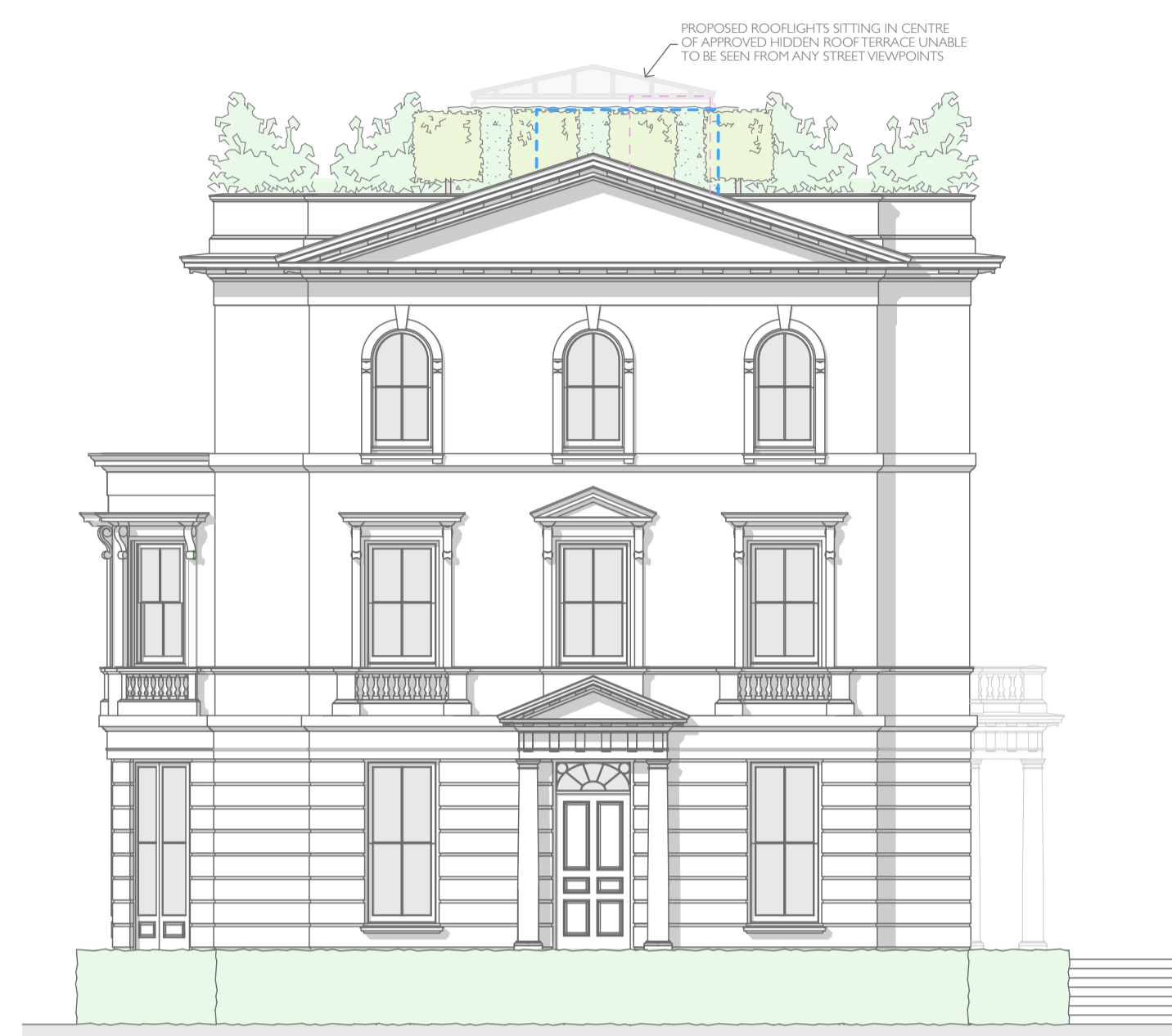
ELEVATION 2 WITH APPROVED PLANTING