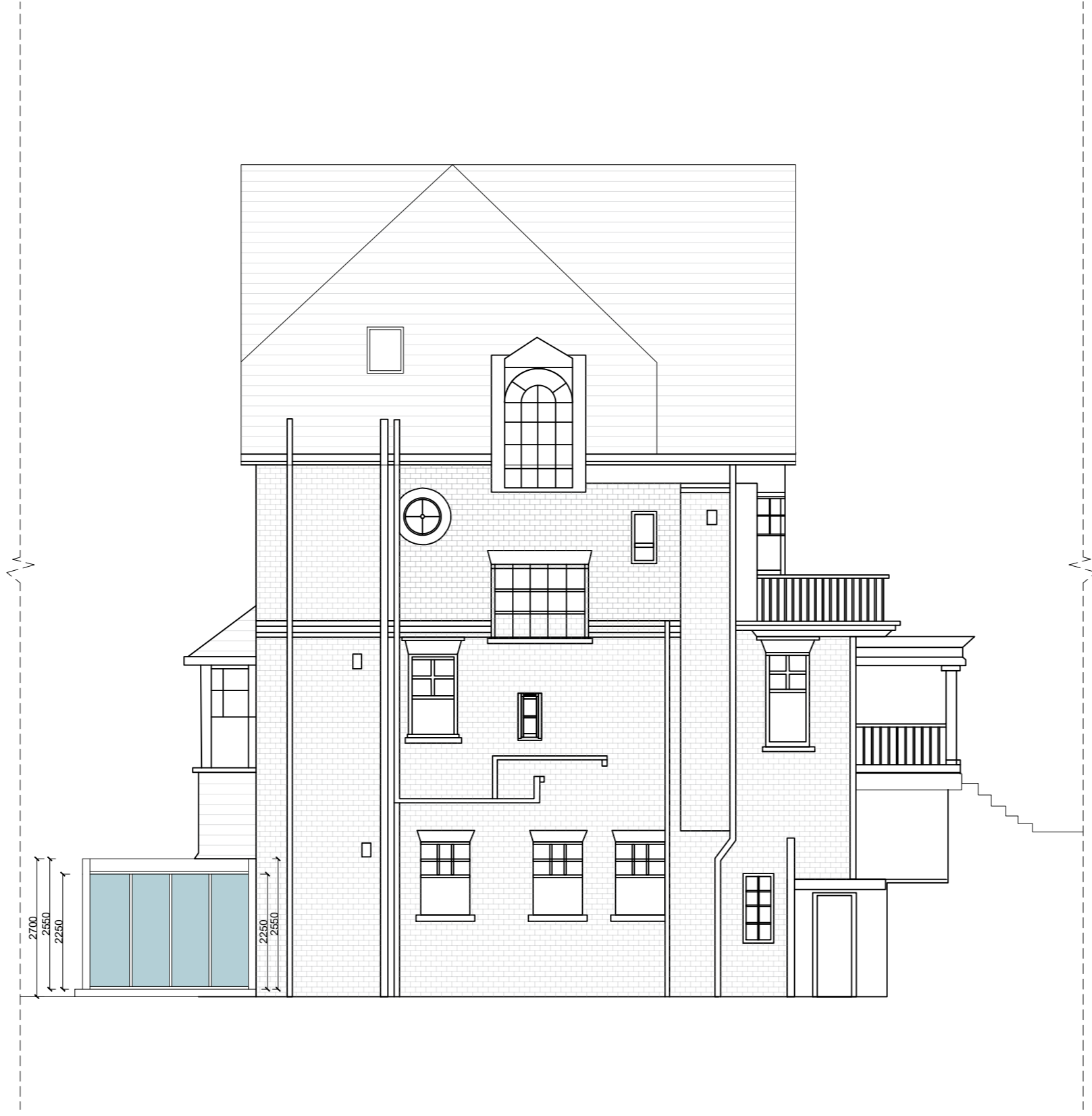
Existing East Elevation