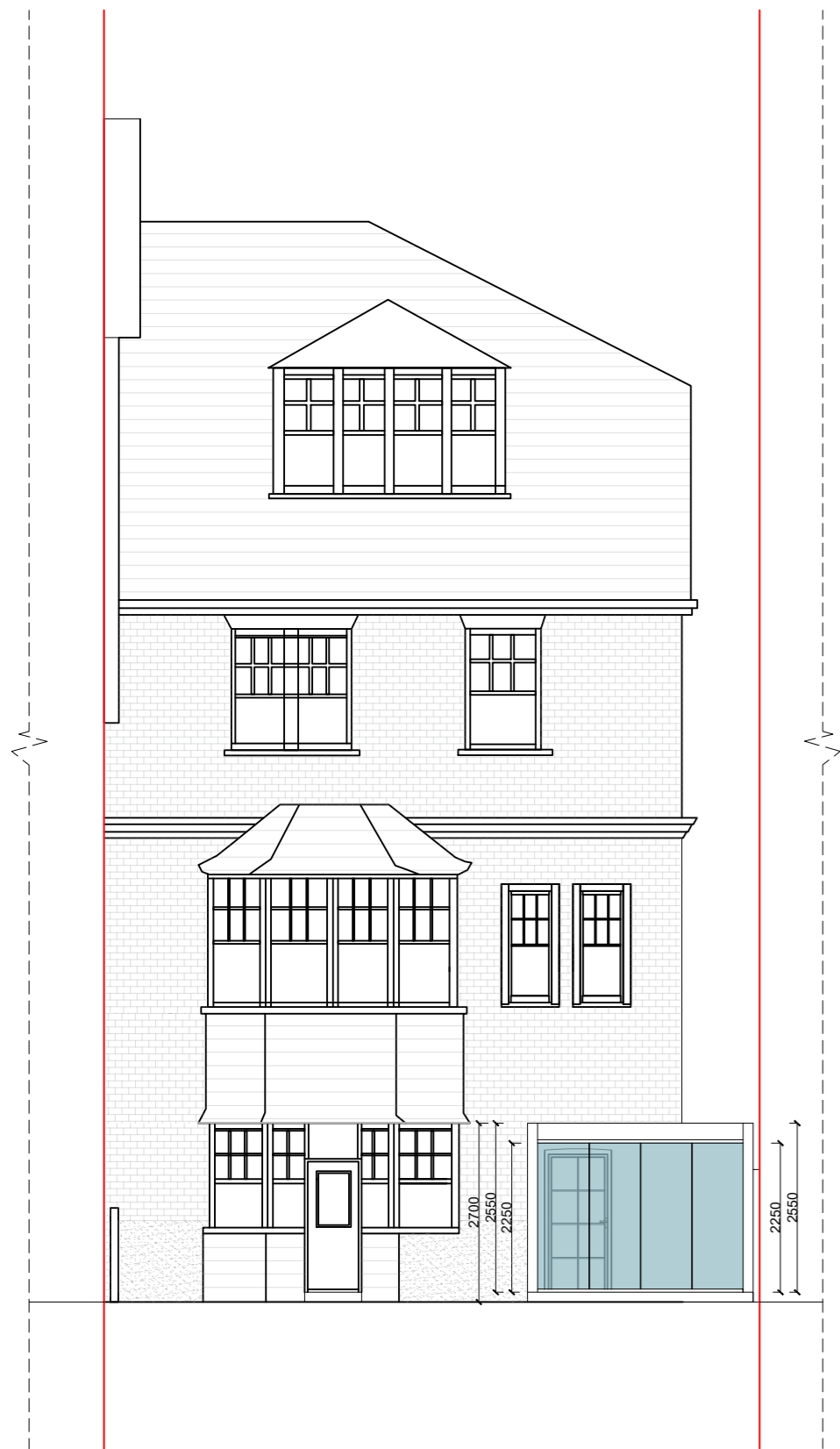
Existing Sout Elevation