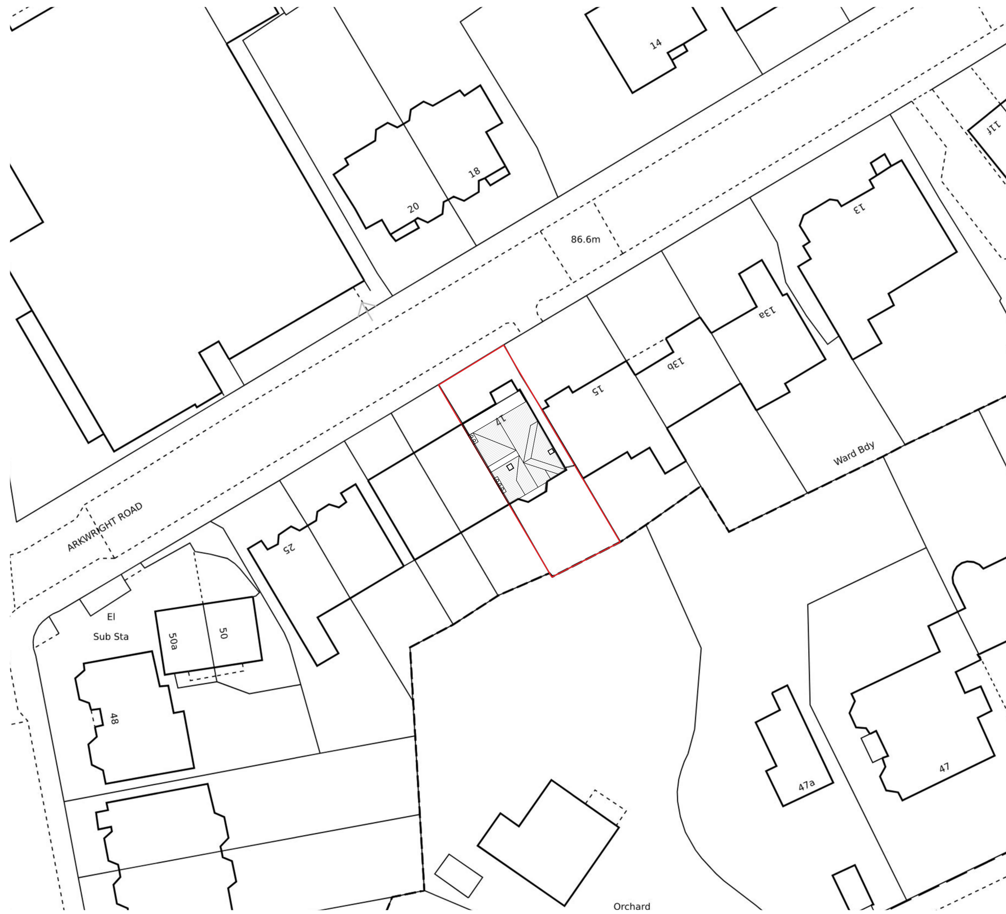
Pre-Existing Block Plan

Any dimensions shown should be checked on site and discrepancies reported to the Architect prior to construction. Designs are not coordinated with engineer projects. Do not scale for construction purposes.