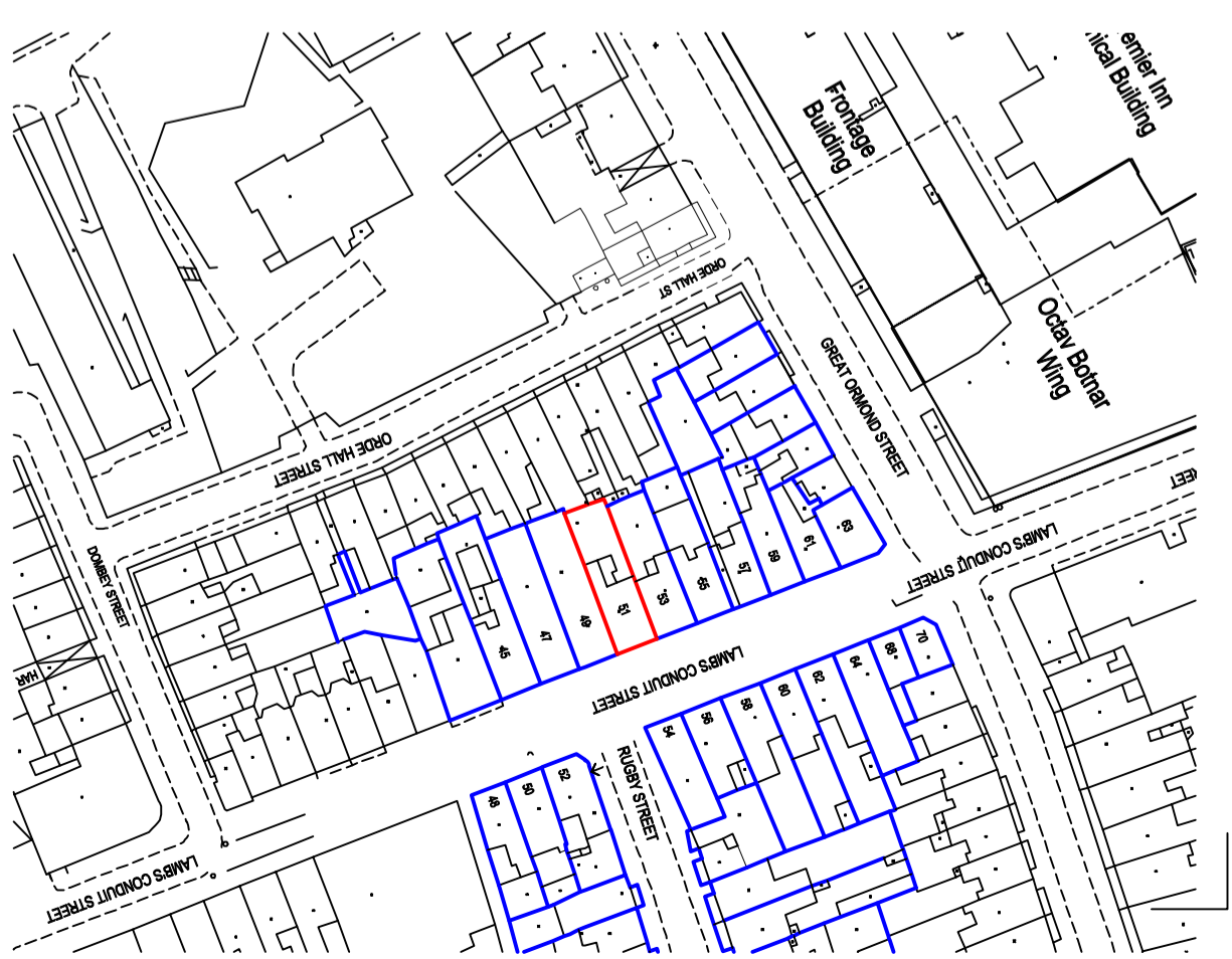
LOCATION PLAN (1/1250@A3)