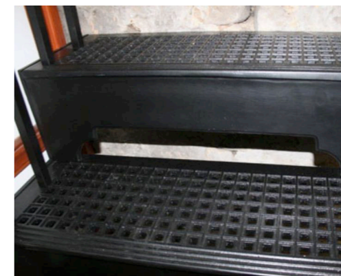
Image below shows the black colour / finish this will be coated to, the grey image above is to show what it will look like from above