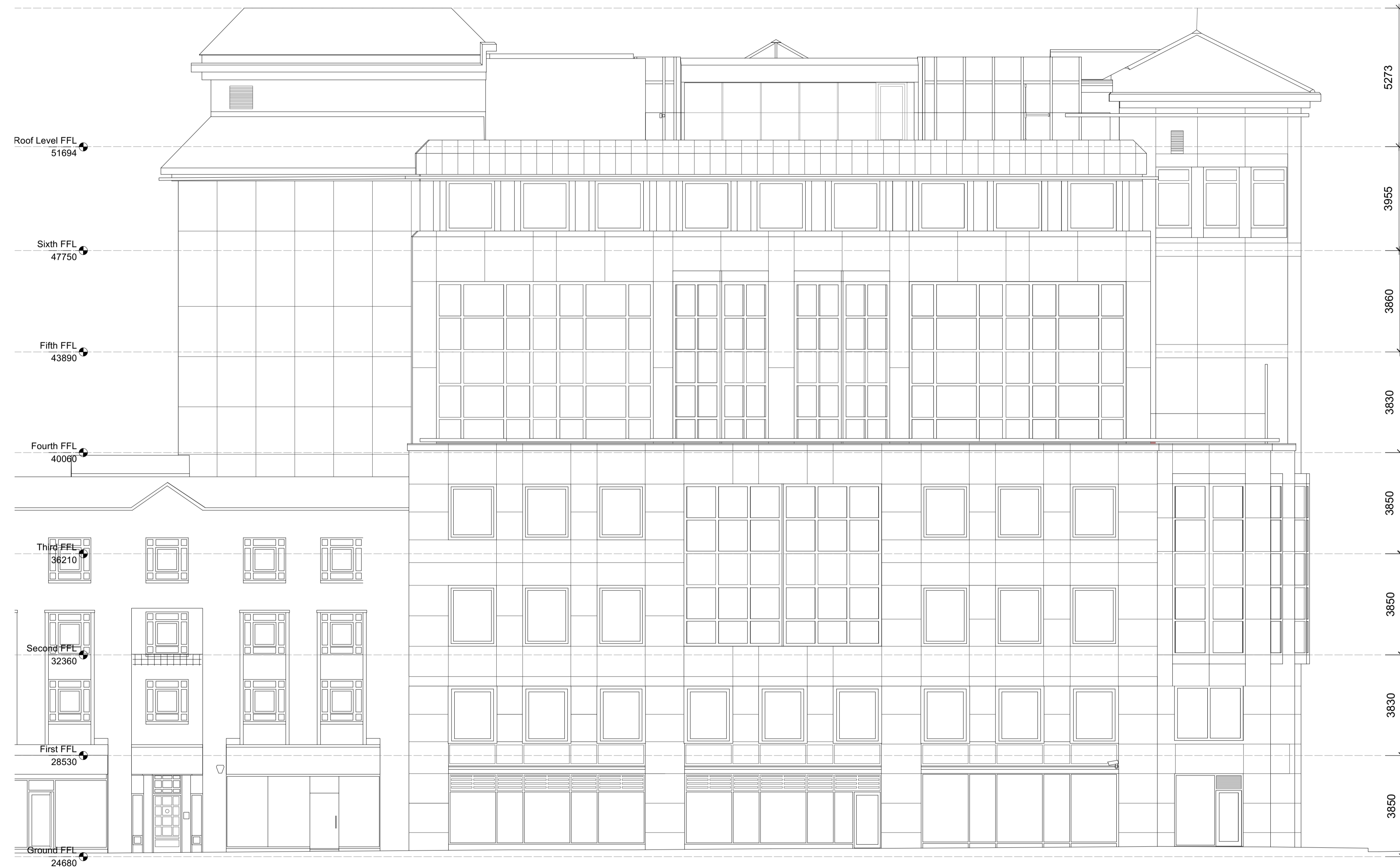
1 Existing North Elevation Scale: 1:100