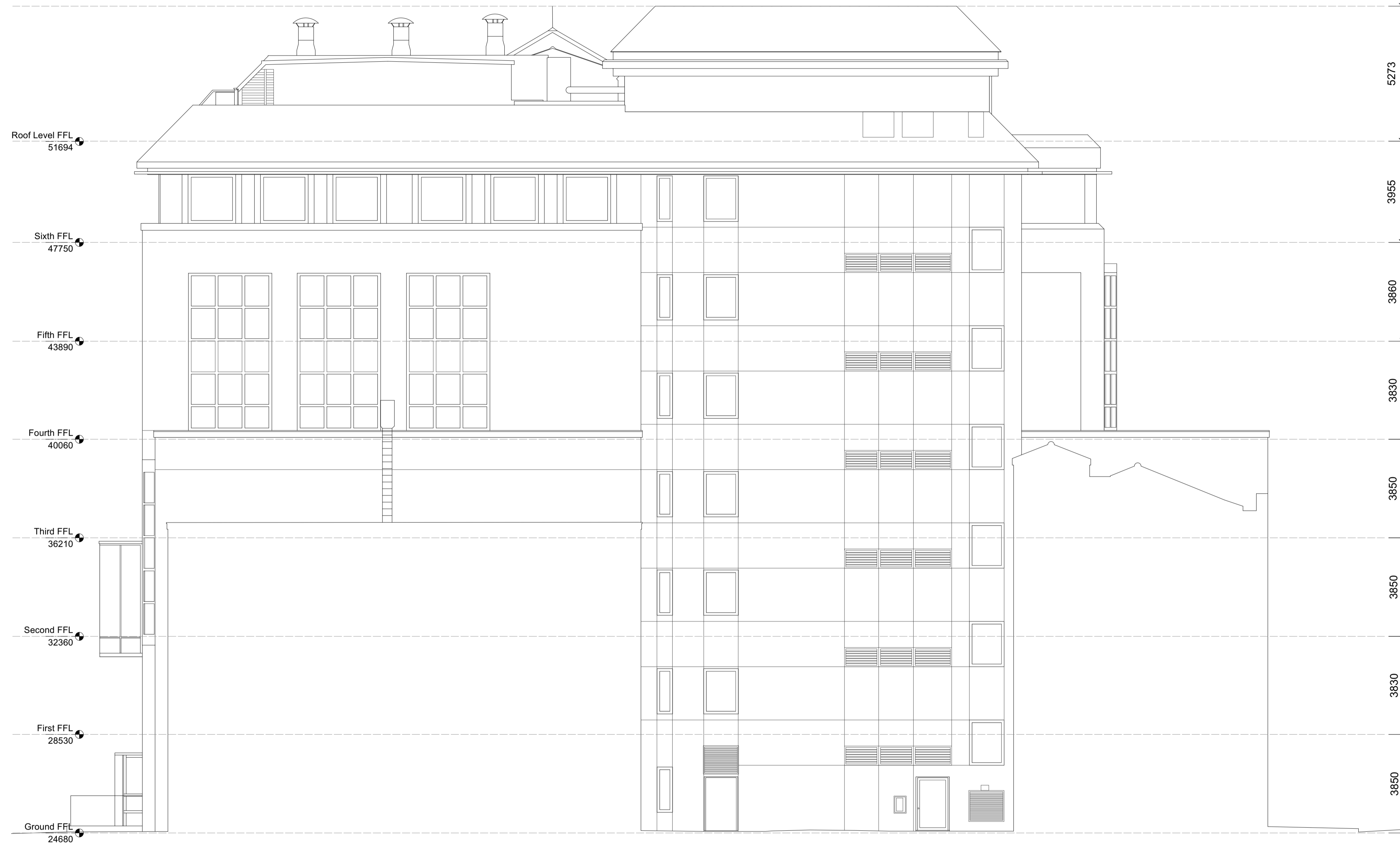
1 Existing East Elevation Scale: 1:100