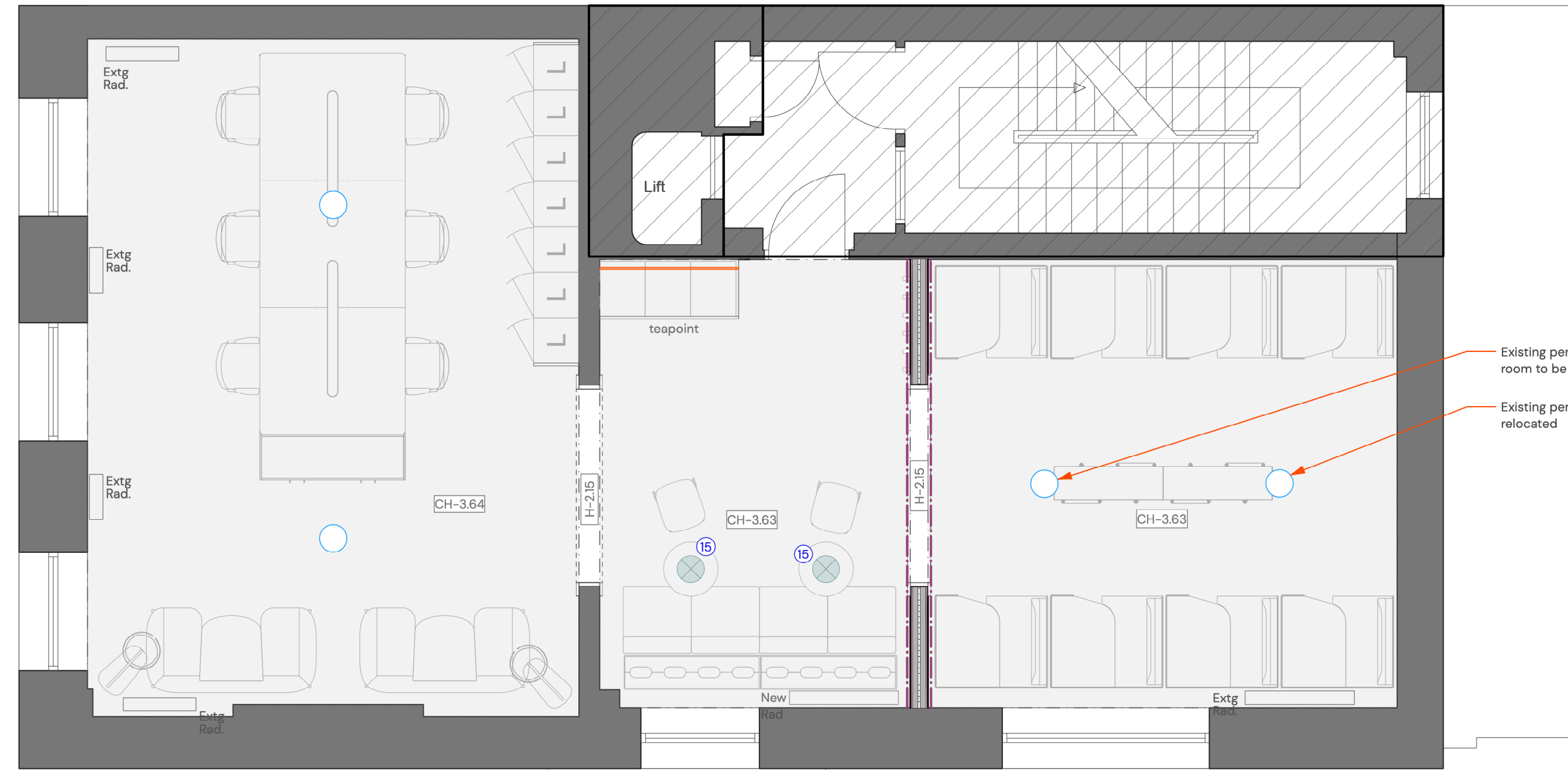
First Floor Plan Scale: 1:50