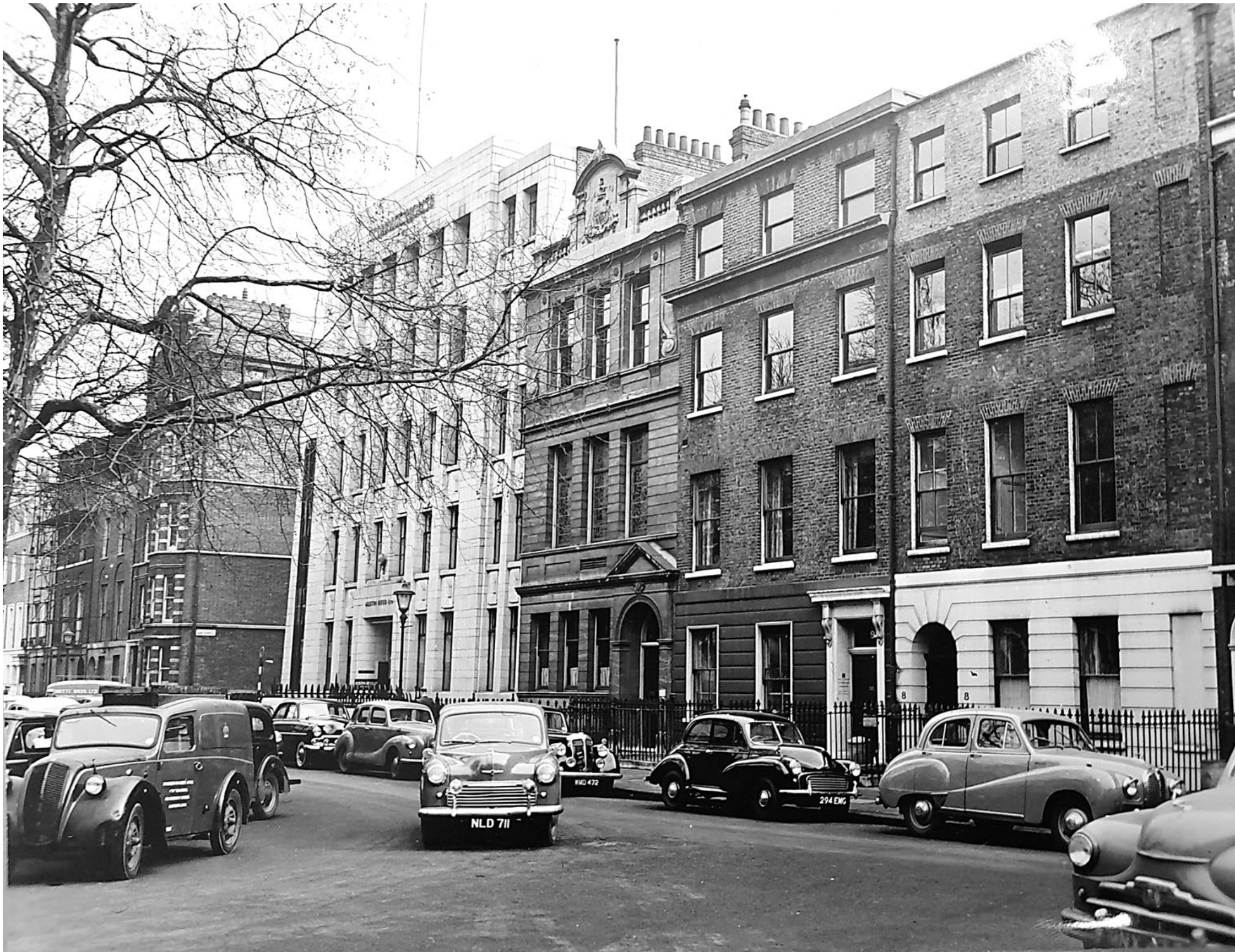
Figure 27. Southside, Red Lion Square c.1950s