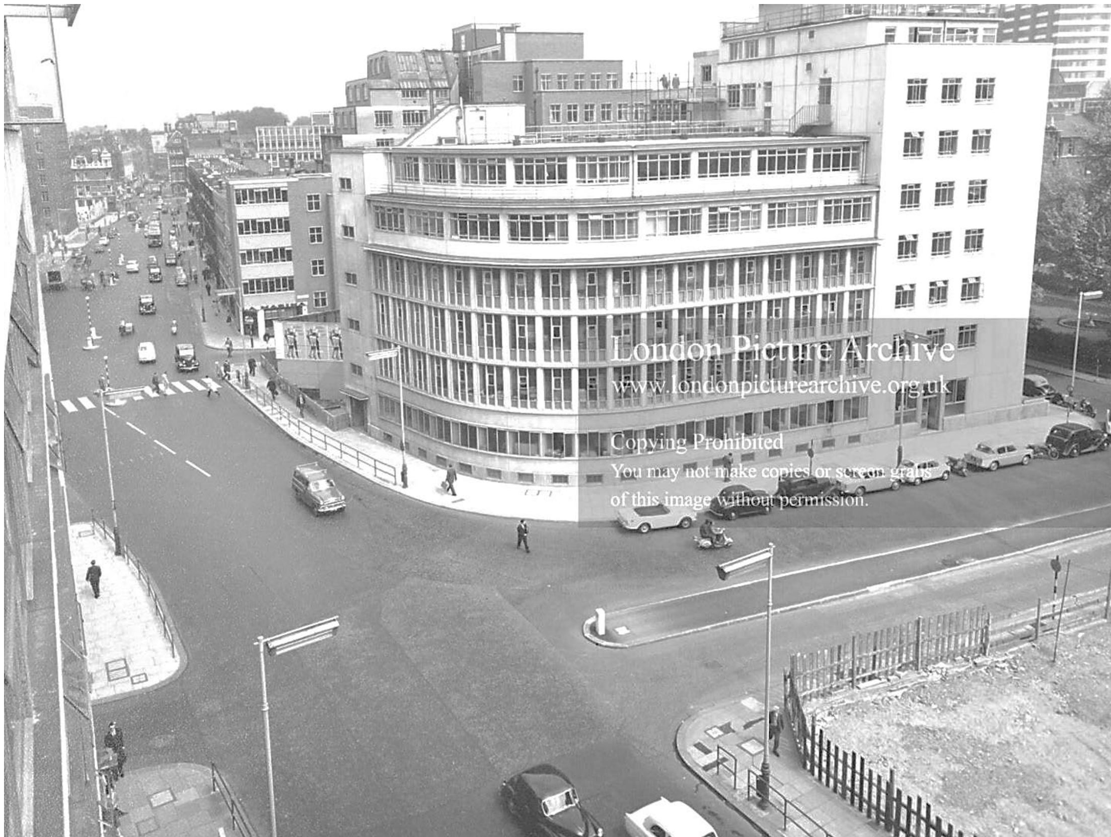
Figure 32. 26 Red Lion Square, former Hannaway House, 1960 (background)