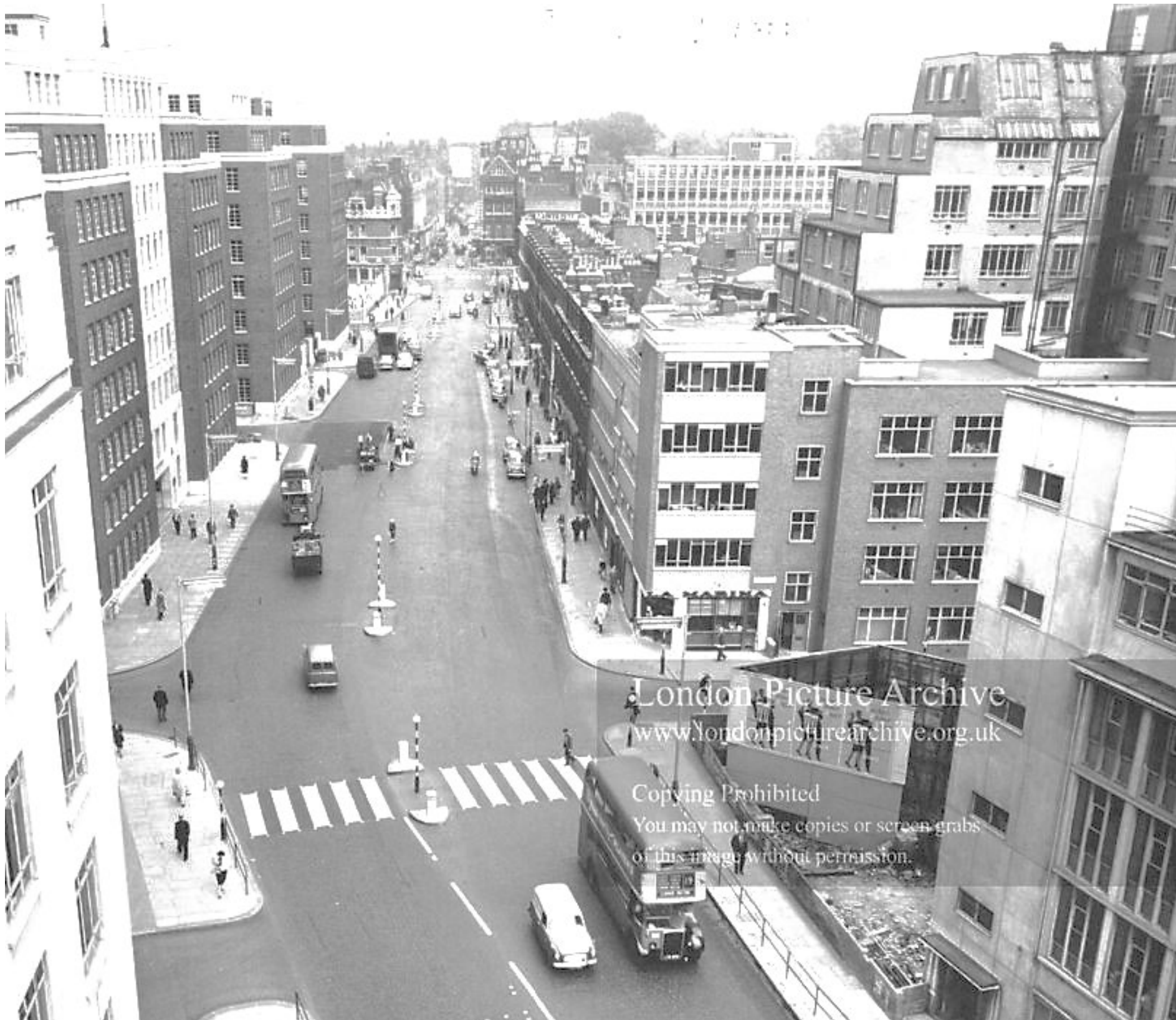
Figure 31. 26 Red Lion Square, former Hannaway House, 1960 (middle left)