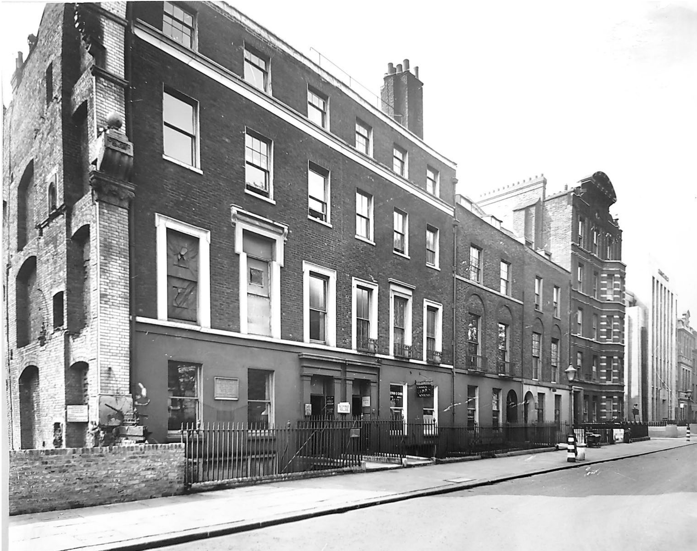
Figure 28. Nos 17-14 Red Lion Square, Postwar Era