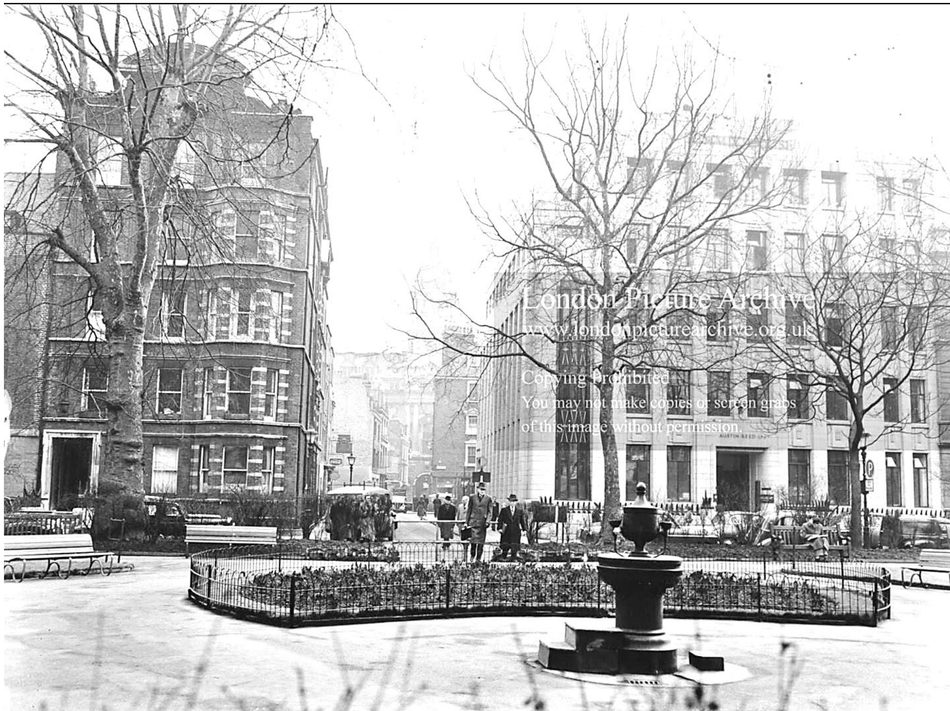
Figure 30. Red Lion Square Gardens, Looking South, 1959