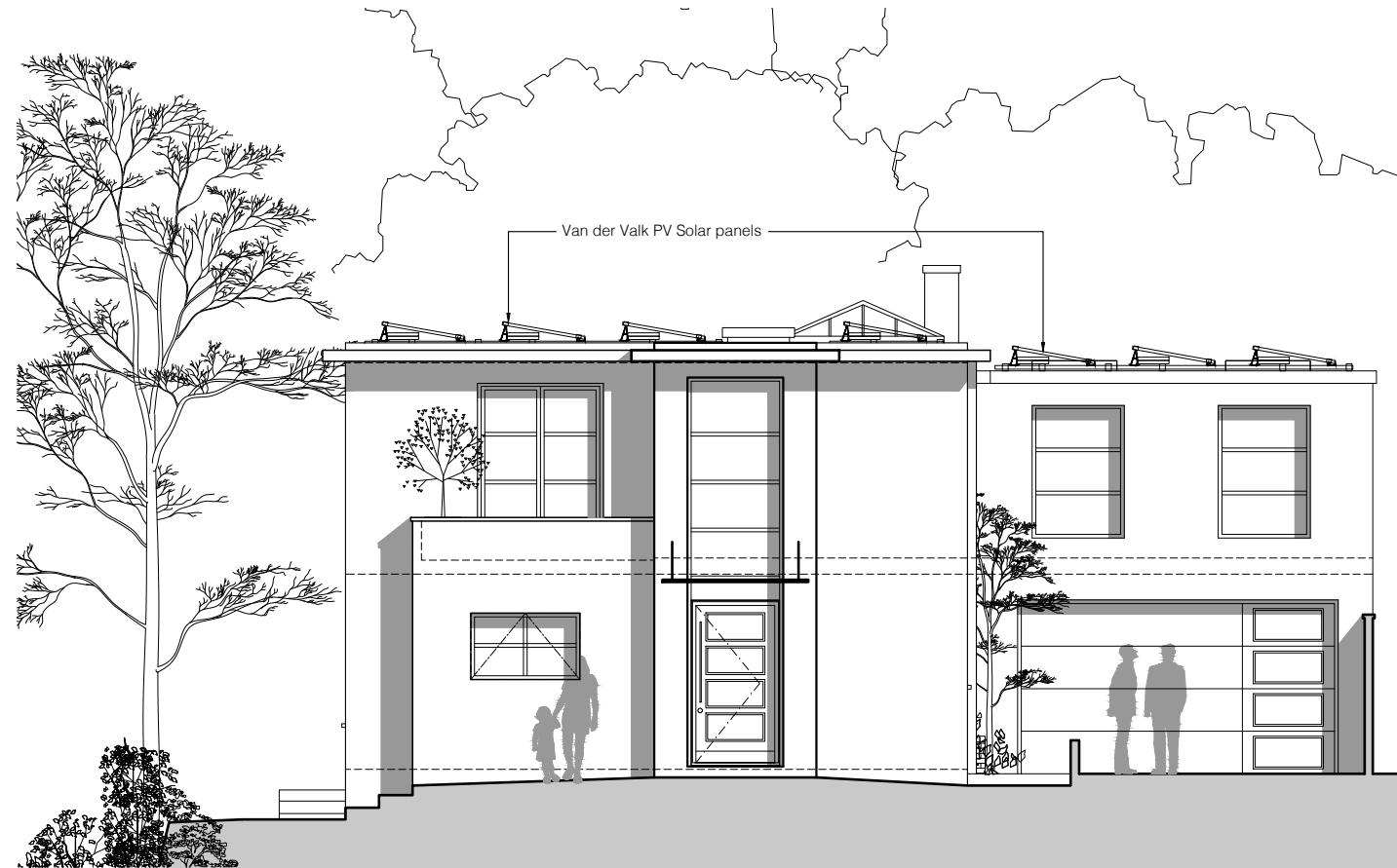
PROPOSED FRONT ELEVATION A-A SCALE 1:100 © A3

Notes DO NOT SCALE THIS DRAWING UNLESS USED FOR PLANNING PURPOSES. USE FIGURED DIMENSIONS ONLY. CONTRACTORS ARE RESPONSIBLE FOR TAKING AND CHECKING SITE DIMENSIONS. DESIGN COPYRIGHT IS VESTED IN THE ARCHITECT FROM WHOM CONSENT MUST BE OBTAINED FOR COPYING OR REPRODUCING THIS DRAWING.