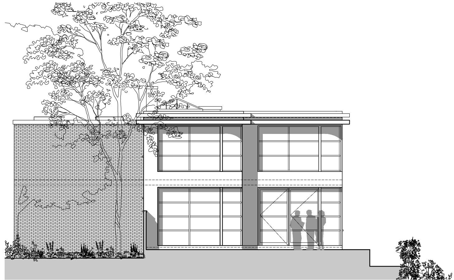
EXISTING REAR ELEVATION C-C SCALE 1:100 @ A3

DO NOT SCALE THIS DRAWING UNLESS USED FOR PLANNING PURPOSES. USE FIGURED DIMENSIONS ONLY CONTRACTORS ARE RESPONSIBLE FOR TAKING AND CHECKING SITE DIMENSIONS DESIGN COPYRIGHT IS VESTED IN THE ARCHITECT FROM WHOM CONSENT MUST BE OBTAINED FOR COPYING OR REPRODUCING THIS DRAWING