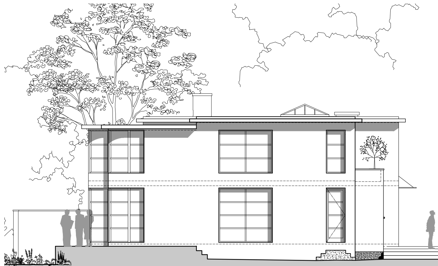
EXISTING SIDE ELEVATION D-D SCALE 1:100 @ A3