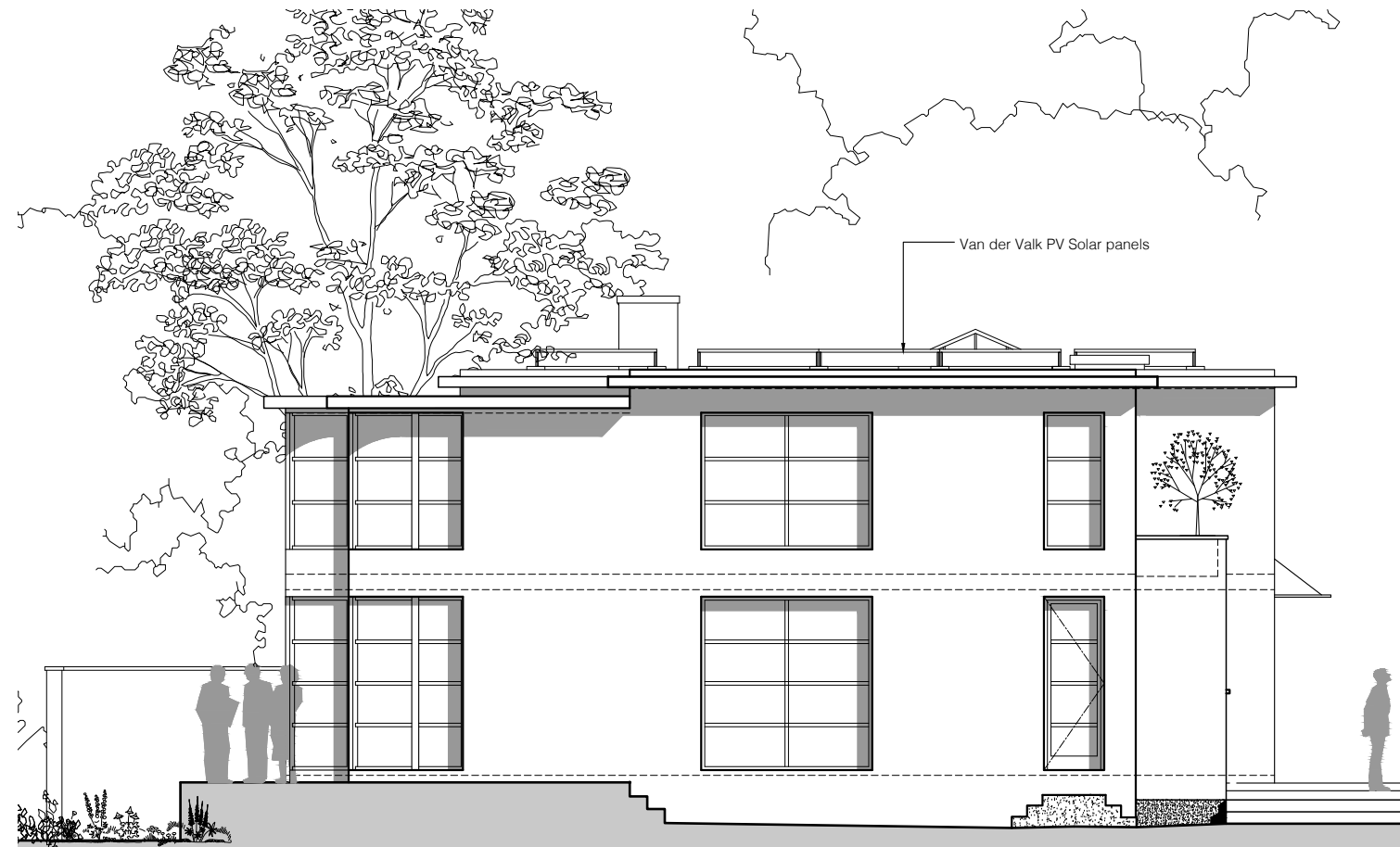
PROPOSED SIDE ELEVATION D-D SCALE 1:100 @ A3