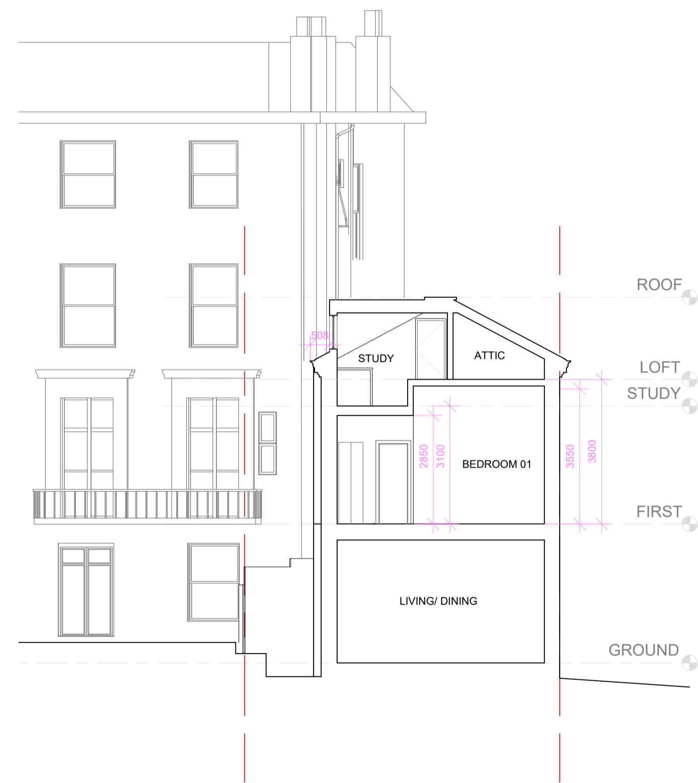
9. SECTION BB 1:100