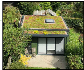
Green roof system