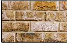
Yellow bricks to boundary wall to match 94