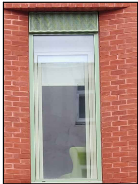
Green windows to match nearby property