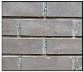
Grey bricks to main building to match adjacent building