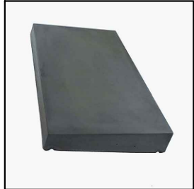
Grey colour coping stones