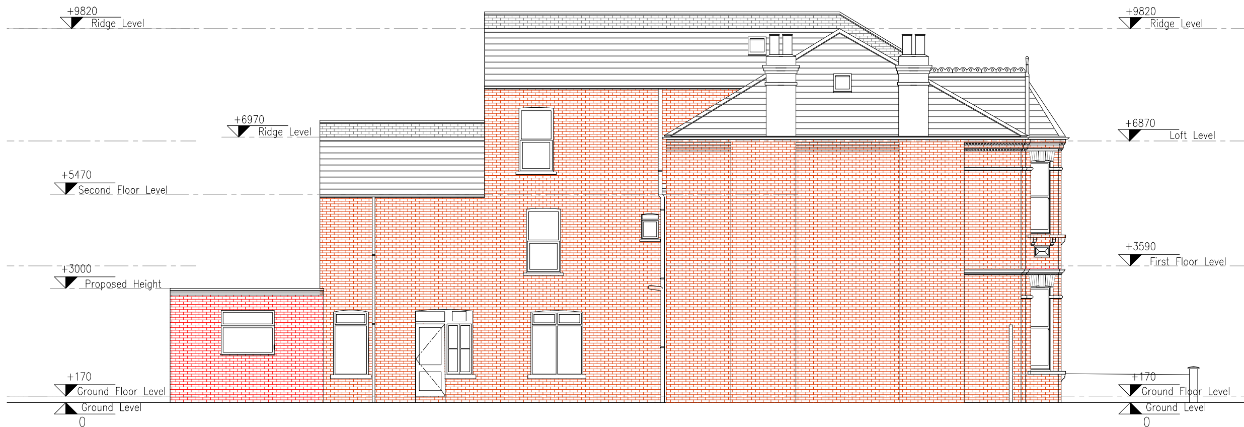
19 PROPOSED SIDE ELEVATION SCALE 1:100 @ A3

Contact: 0203420027 Email: info@archlucid.com