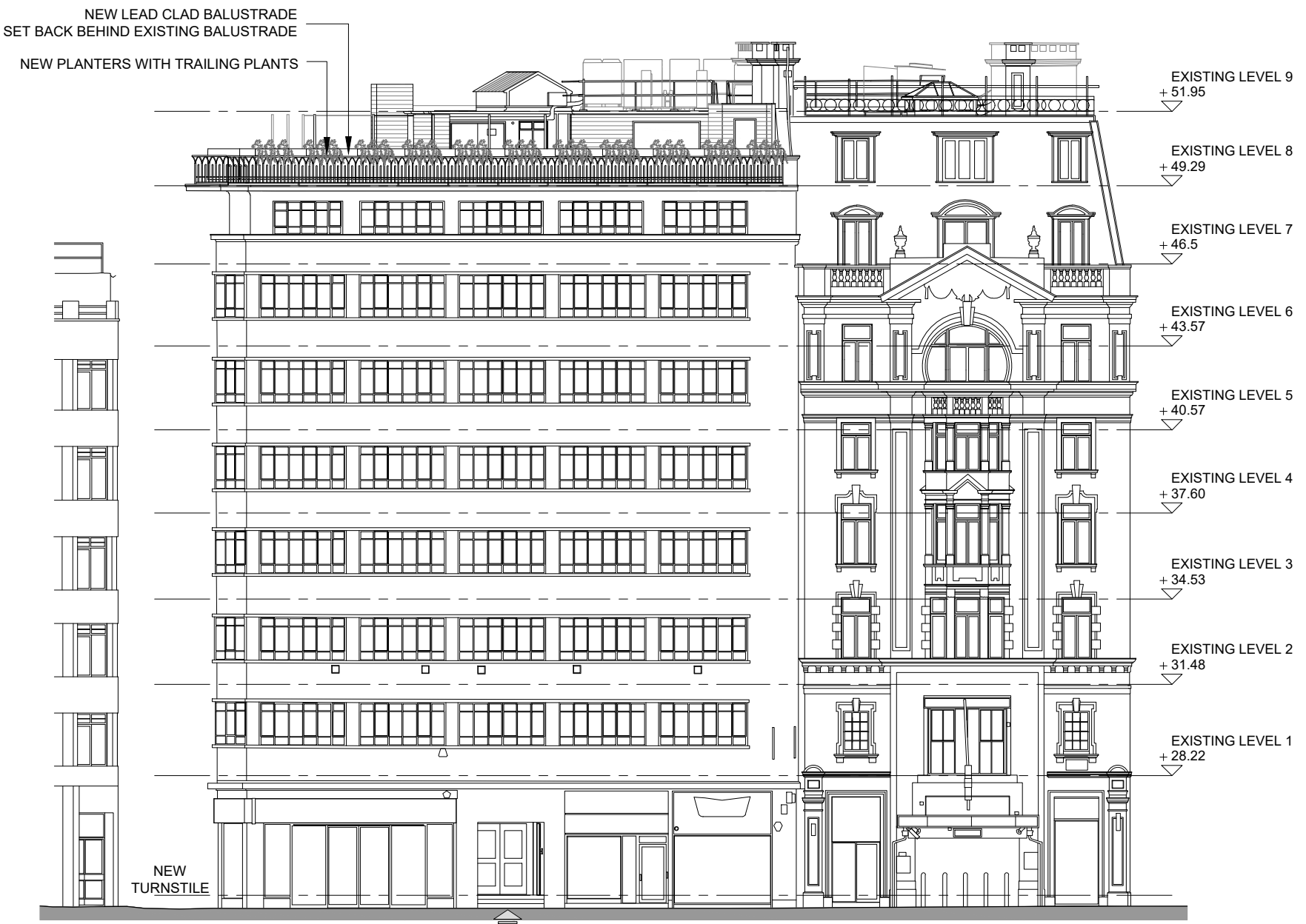
ELEVATION 3 (NORTH)