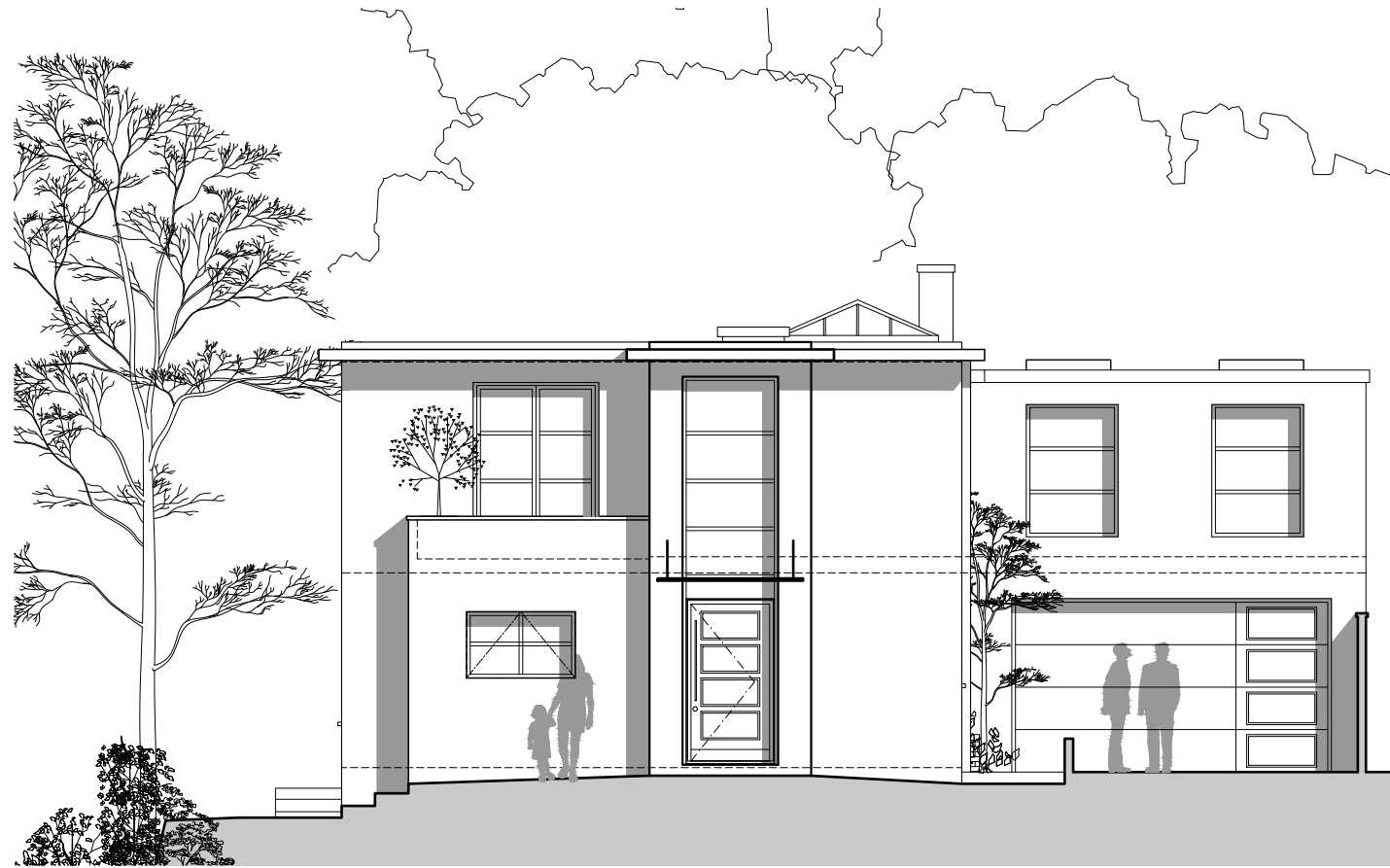
EXISTING FRONT ELEVATION A-A SCALE 1:100 © A3

Notes DO NOT SCALE THIS DRAWING UNLESS USED FOR PLANNING PURPOSES. USE FIGURED DIMENSIONS ONLY CONTRACTORS ARE RESPONSIBLE FOR TAKING AND CHECKING SITE DIMENSIONS DESIGN COPYRIGHT IS VESTED IN THE ARCHITECT FROM WHOM CONSENT MUST BE OBTAINED FOR COPYING OR REPRODUCING THIS DRAWING