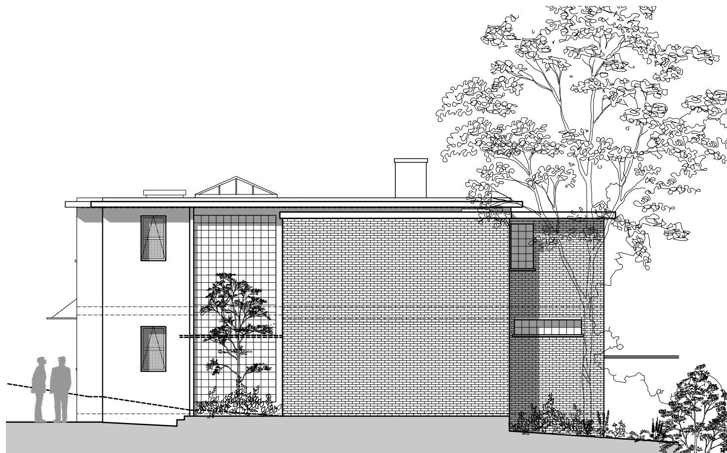
EXISTING SIDE ELEVATION B-B SCALE 1:100 © A3