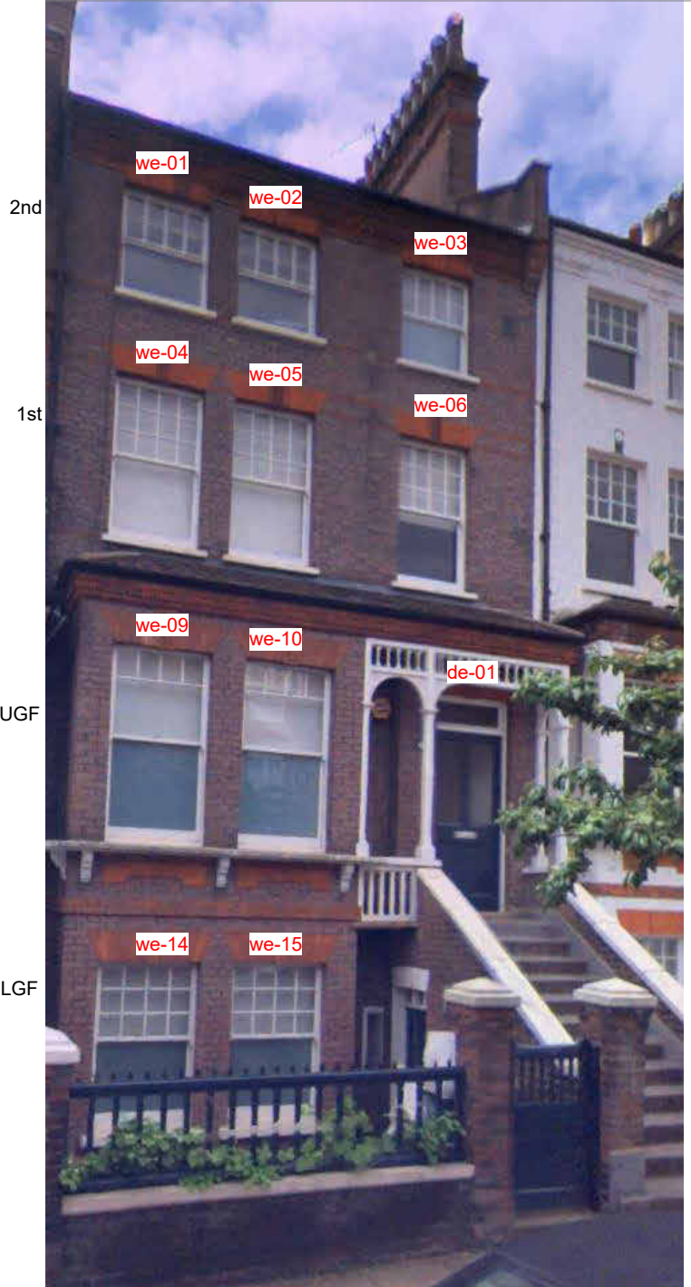
Main front elevation overview

This is a drawing/ document intended for planning and/ or party wall purposes, do not use this as Construction information unless it is issued for Construction. Boundary lines are indicative and do not necessarily represent legal boundaries, which need to be established between the parties involved if necessary. This drawing is copyright by STUDIO VK Ltd.