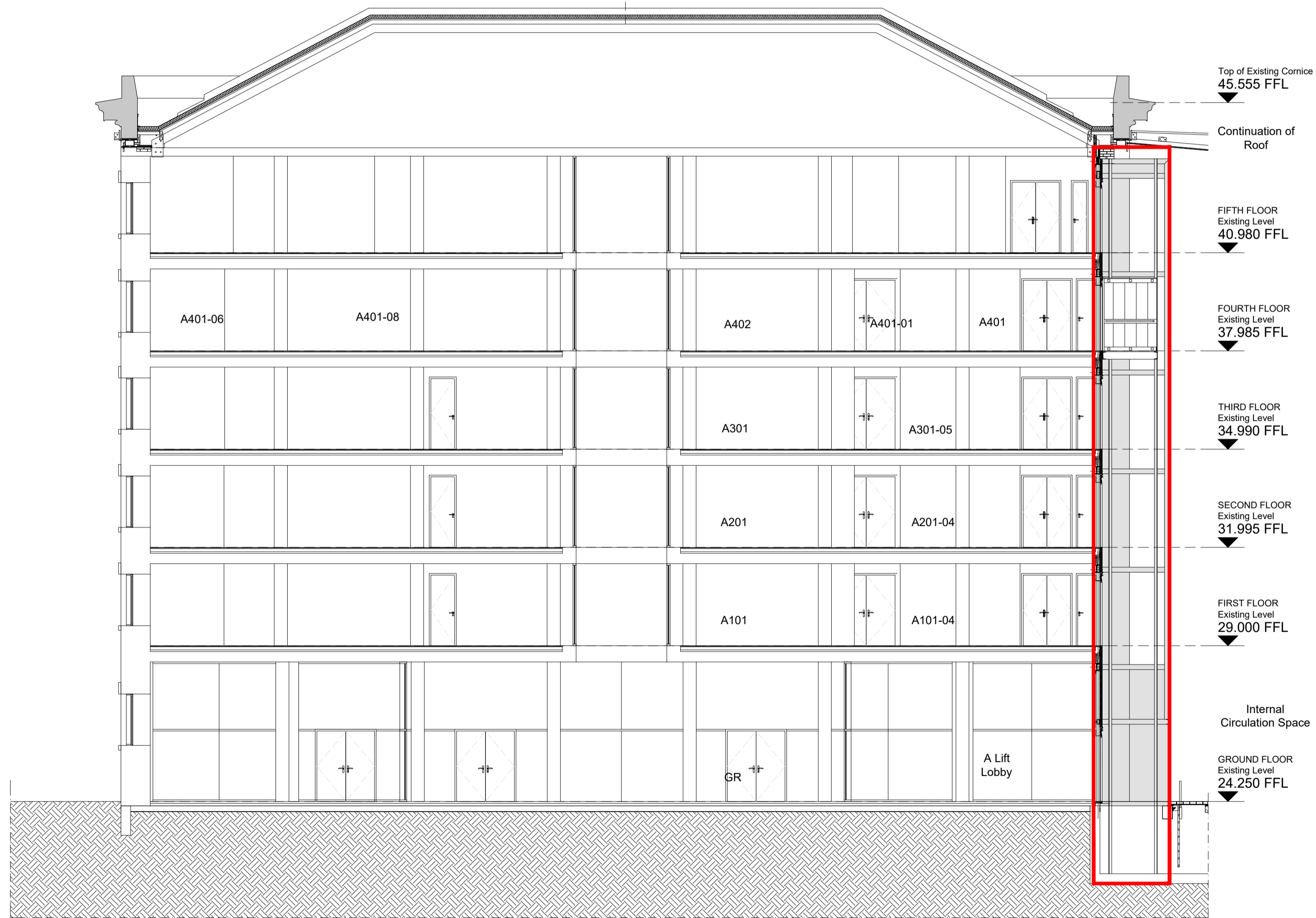
1 EXISTING SITE SECTION 1:100