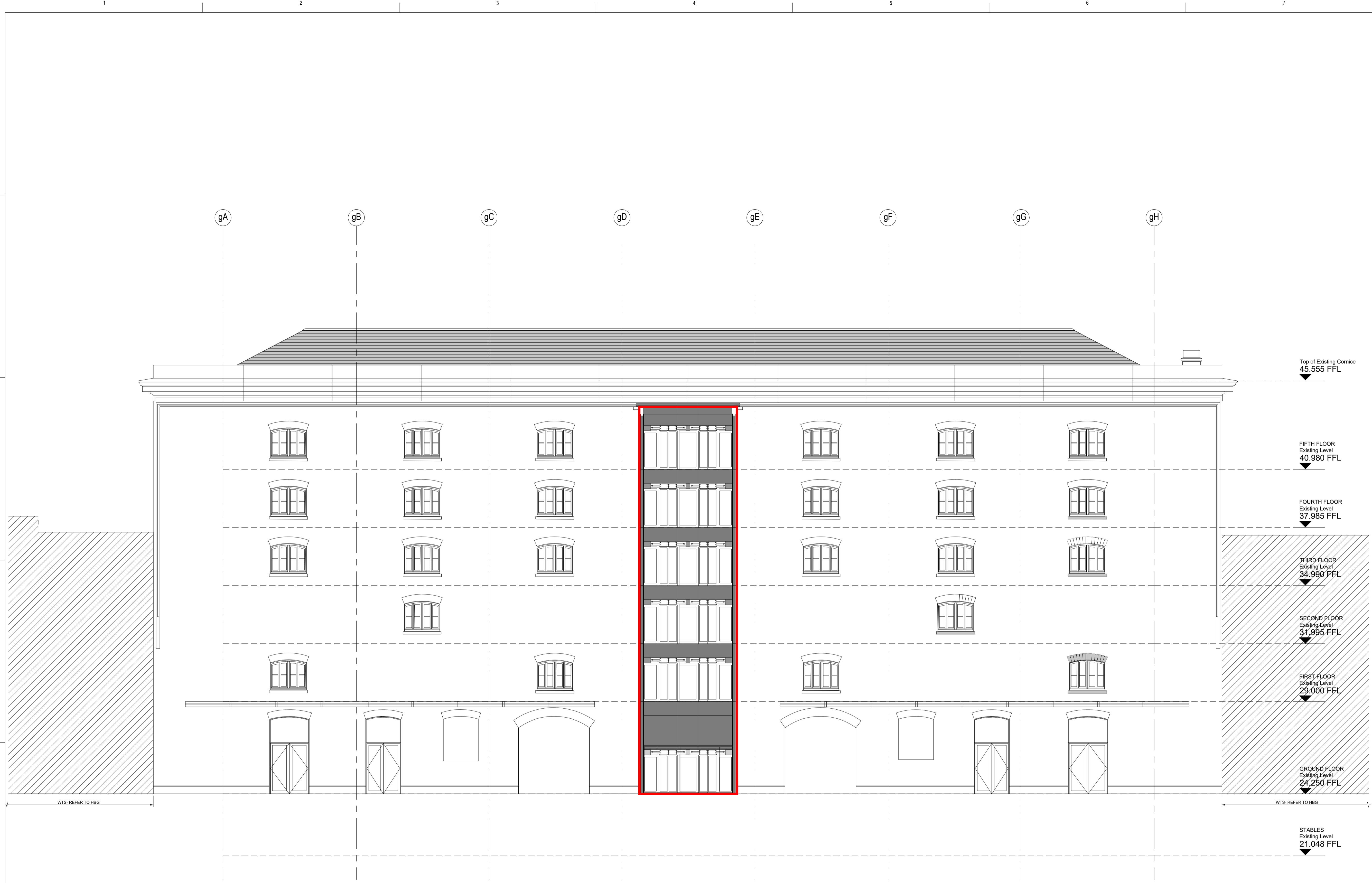
1 EXISTING ELEVATIONS (BUILDING) 1:100