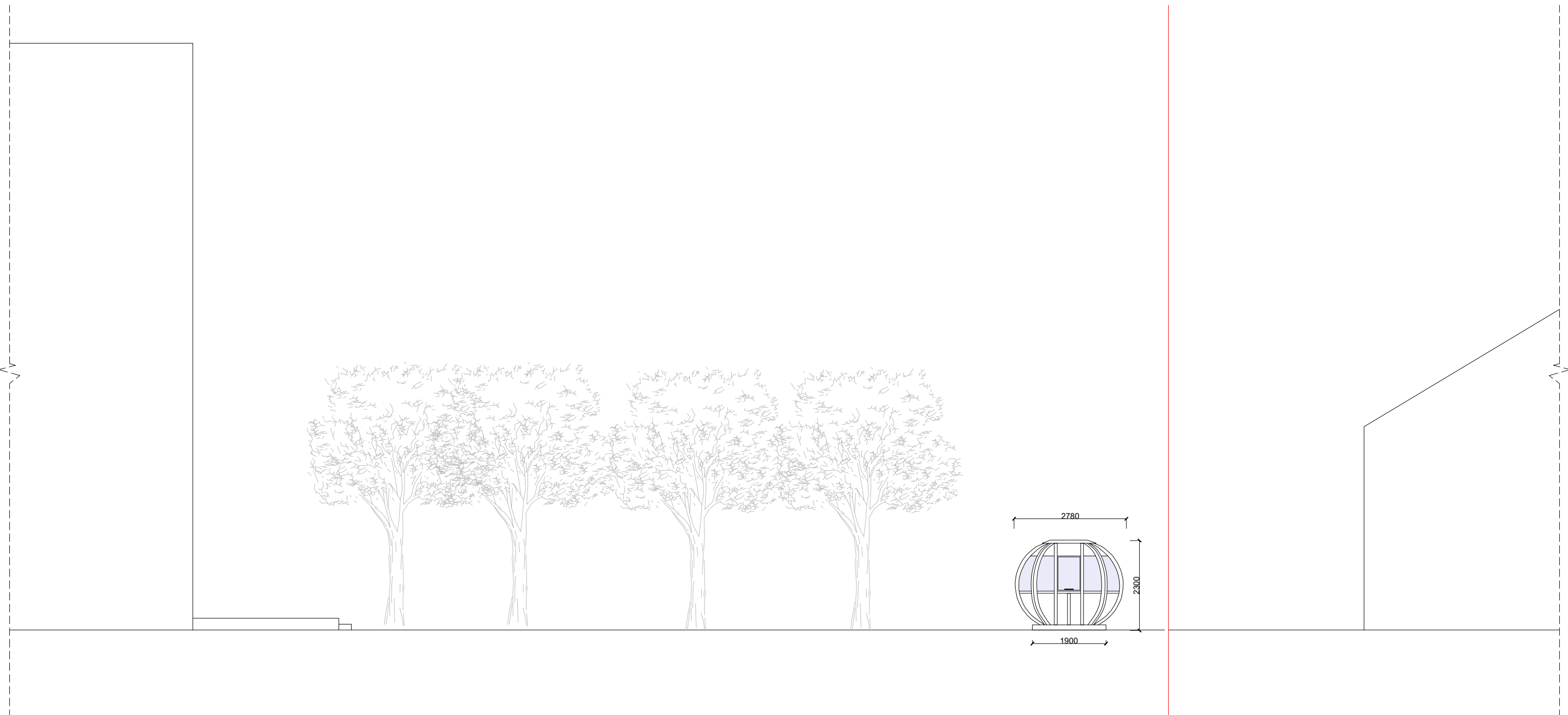
Proposed A-A Section

Any dimensions shown should be checked on site and discrepancies reported to the Architect prior to construction. Designs are not coordinated with engineer projects. Do not scale for construction purposes.