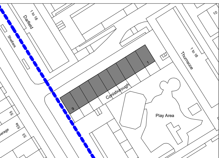
Conisborough Site Plan 1 : 1000

Please refer to 16000 series for full unit type layout information.