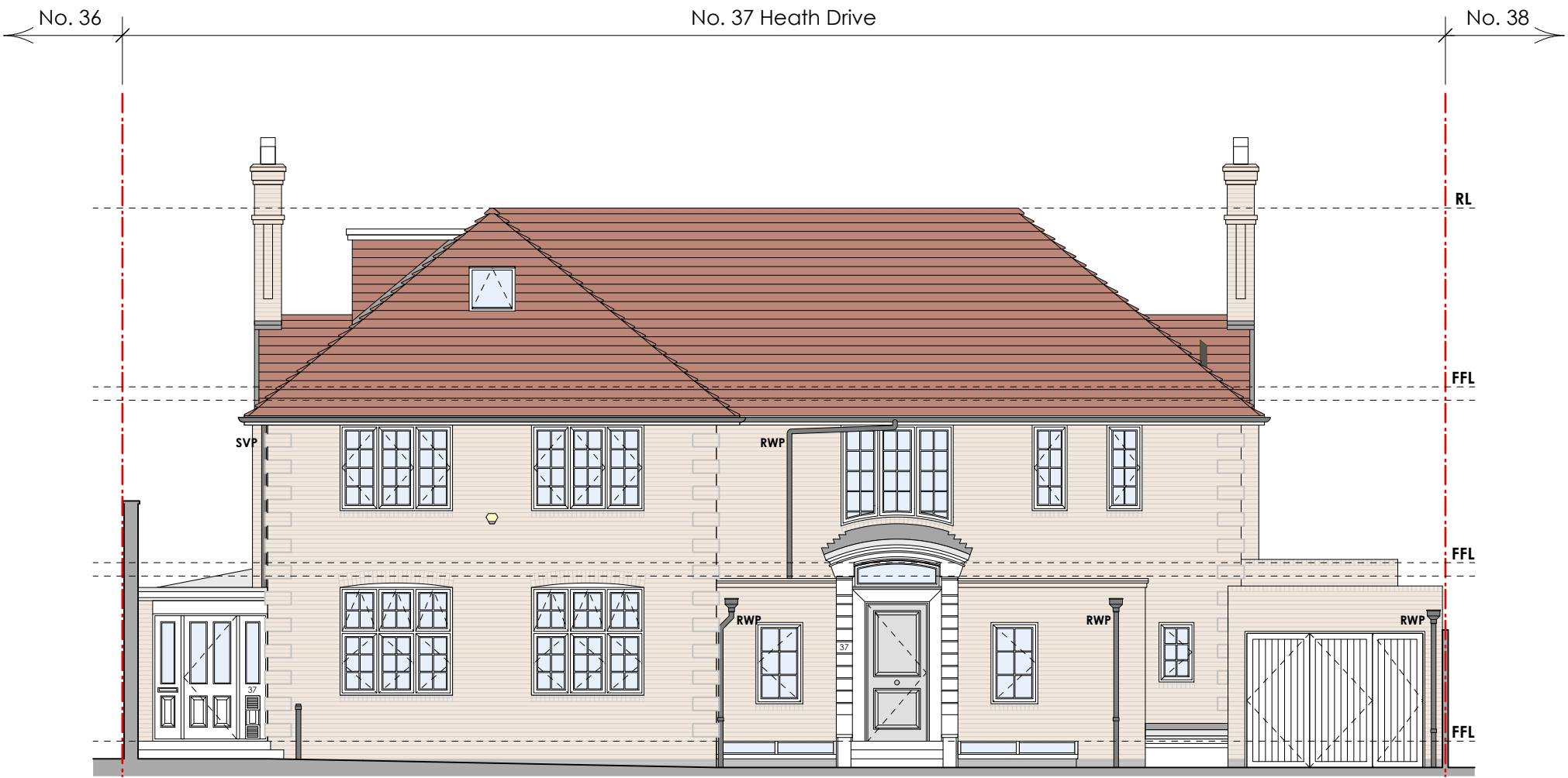
1 Existing Front Elevation scale: 1:100 @ A3