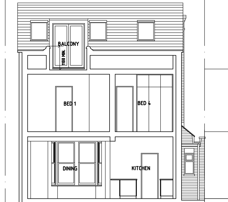
REAR SECTIONAL ELEVATION THROUGH BALCONY