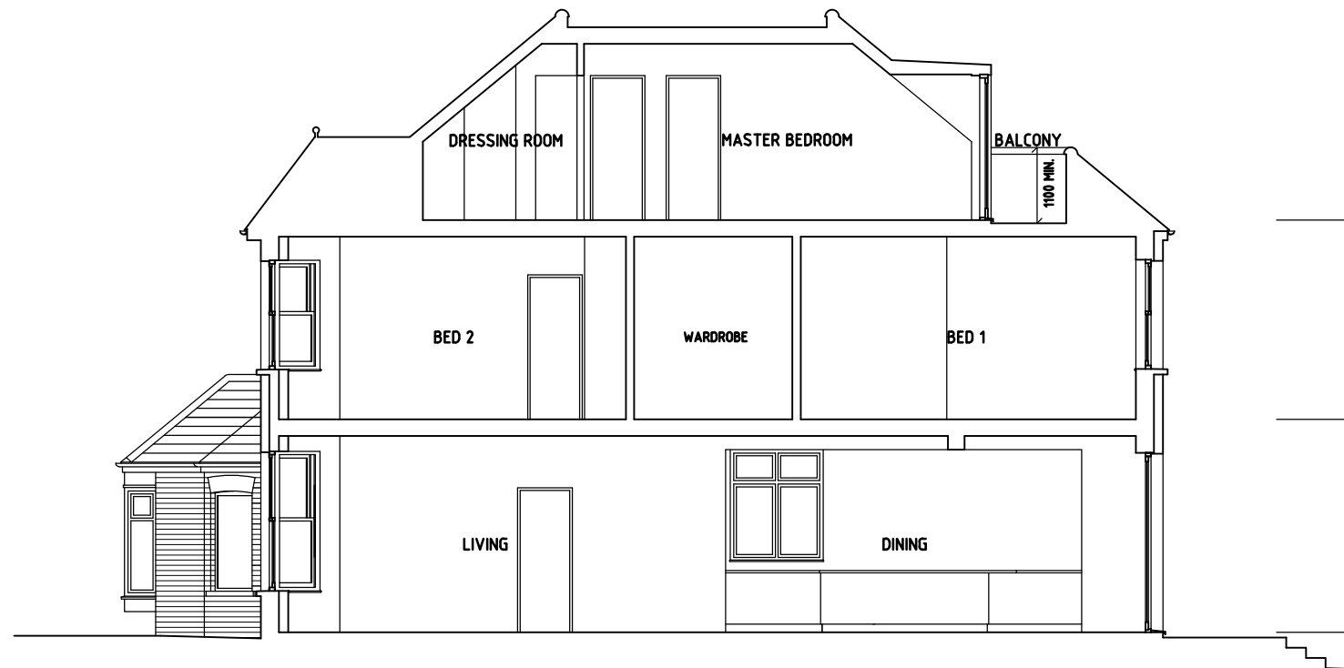
LONG ELEVATION THROUGH BALCONY