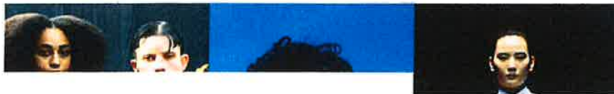
Art School spring/summer 2021 collection catwalk show for LFW Fashion Desk