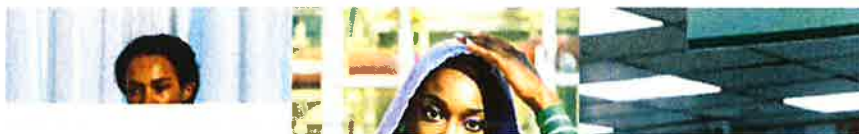
Eudon Choi spring/summer 2021 collection presentation for LFW Fashion Desk