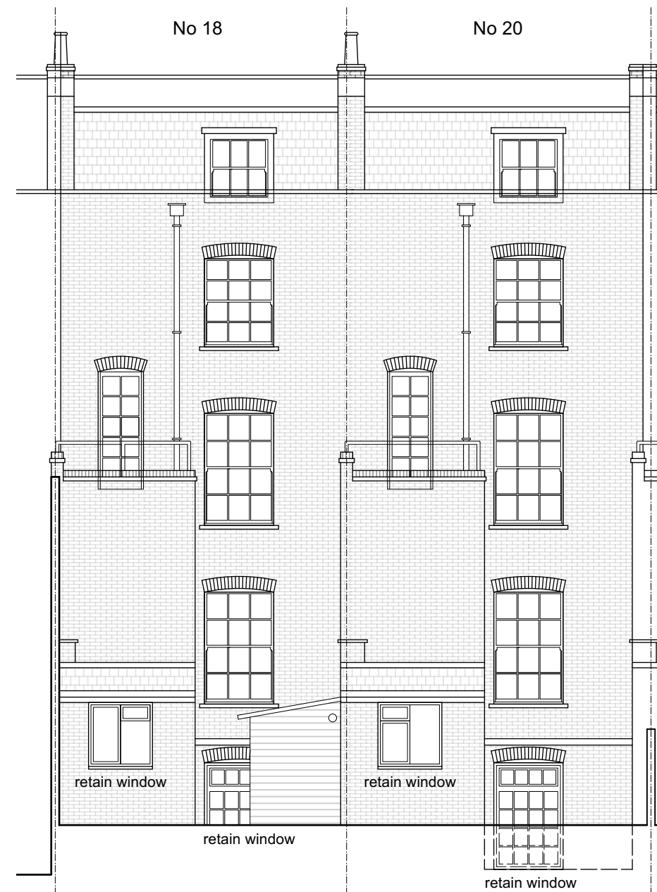
2 Proposed North/East Elevation (02)15 Scale: 1:100