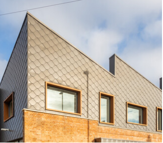
147 Cherry Hint... 27,190 SF Availa...