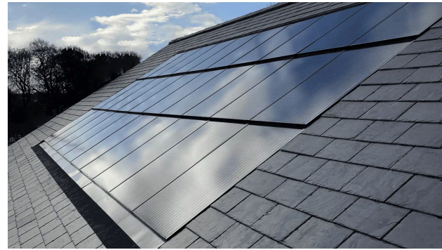
Integrated (in-roof) solar panels