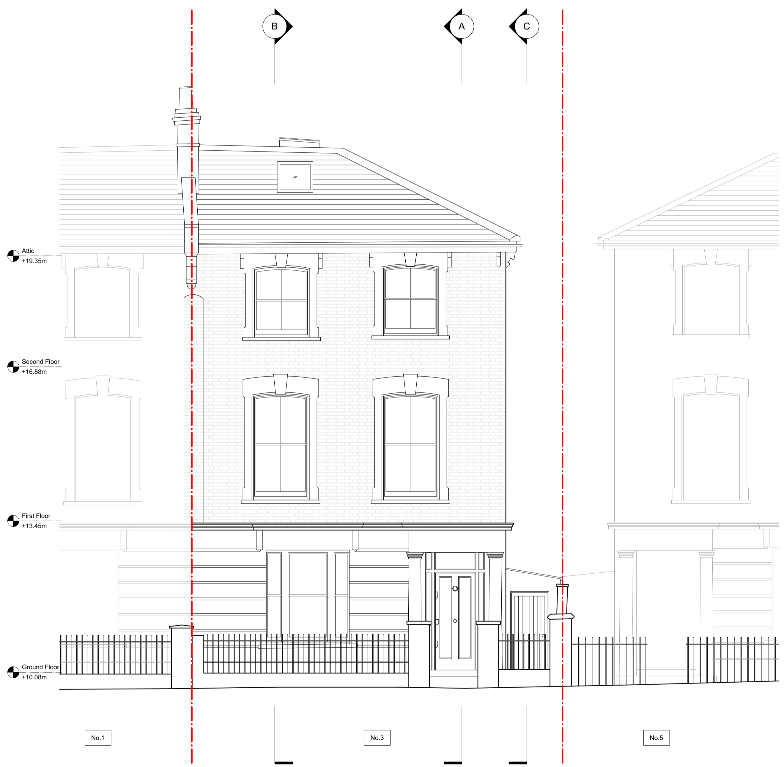
PROPOSED FRONT ELEVATION - NO CHANGE