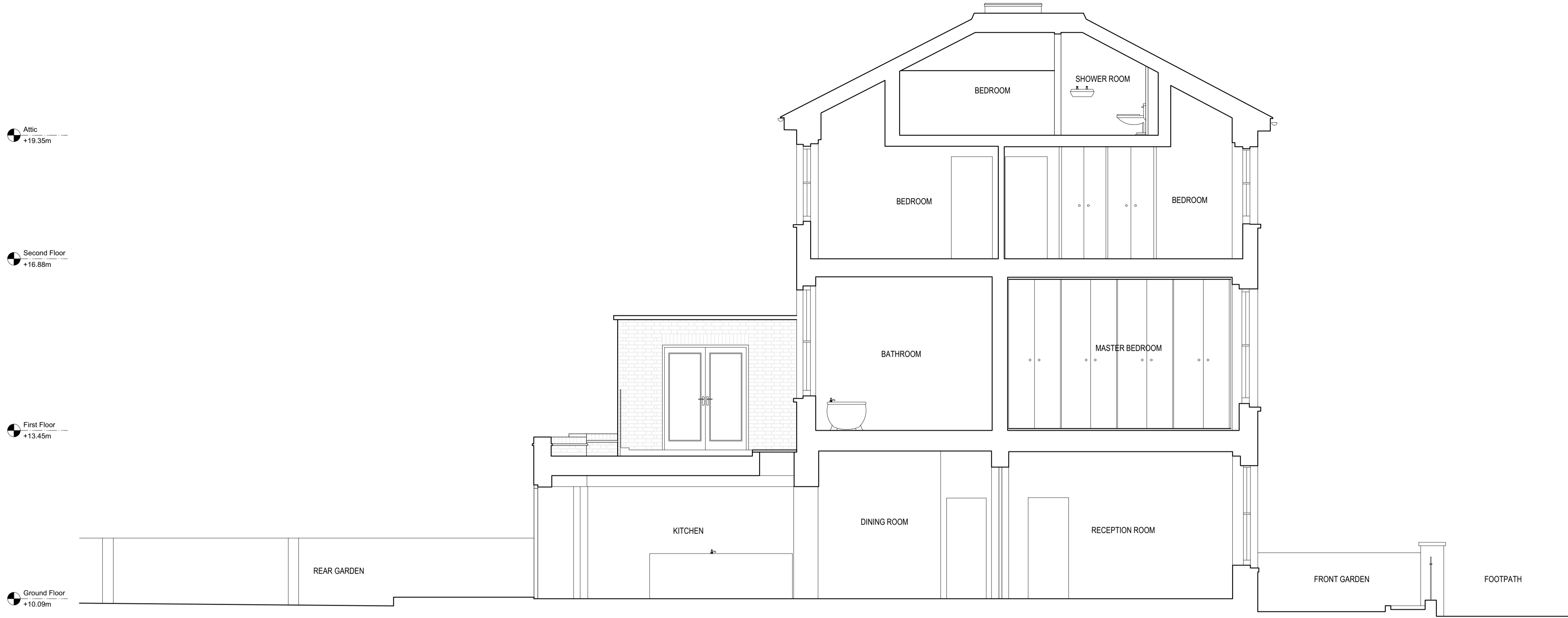
EXISTING SECTION B