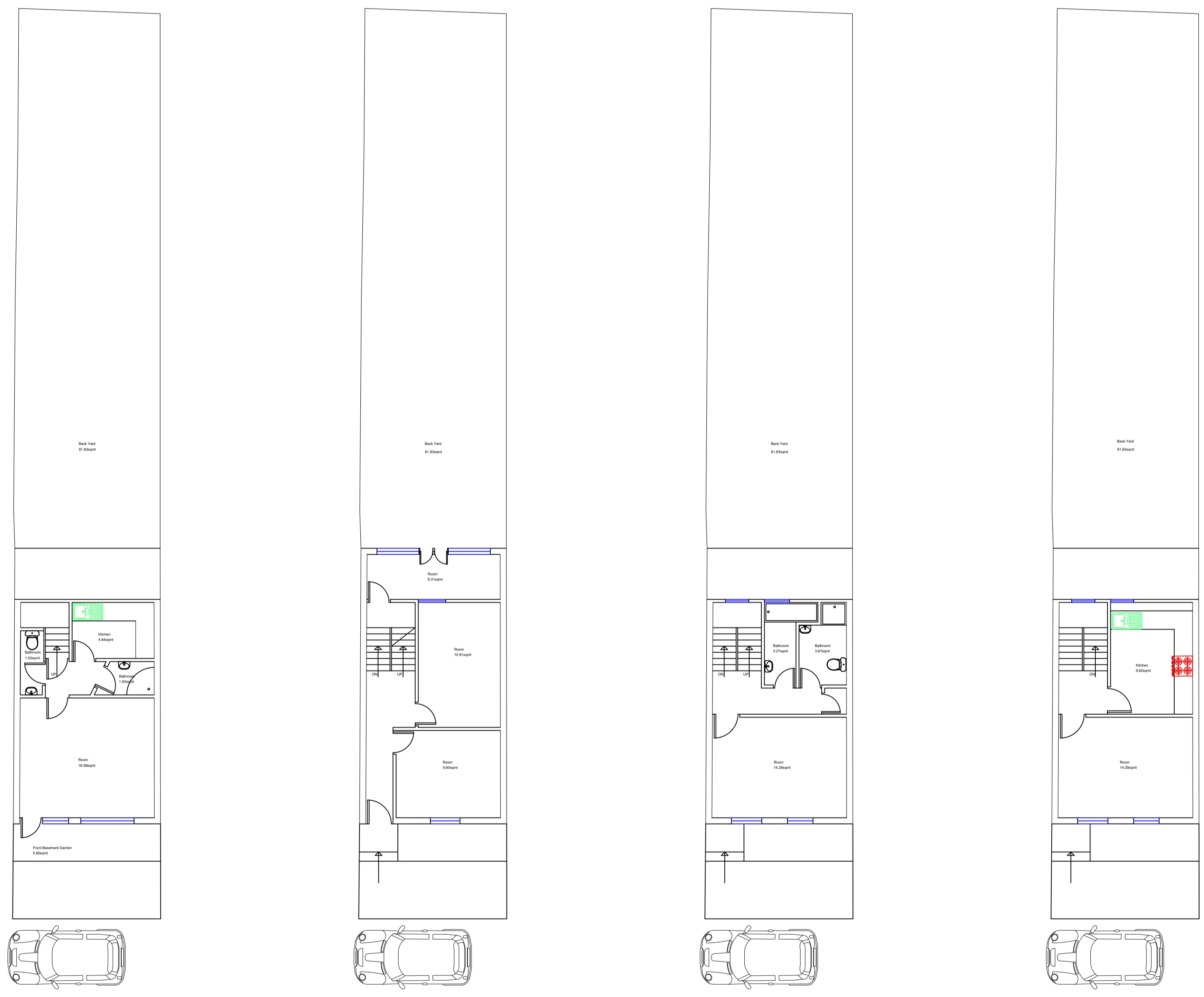
Existing Basement Floor Existing Ground Floor Existing First Floor Existing Second Floor

GoldenSword Design LTD cannot accept responsibility for the integrity and accuracy of such information. Any clarification and/or additions that are required appertaining to such information should be sought from the relevant profession or their appointment representative. Drawings, specifications and schedules are to be read in conjunction with the following where applicable: Employer's Requirements documents, Agreements to Lease, Structural Engineer's drawings and specifications, Civil Engineer's drawings and specifications, Survey Drawings, Party Wall/Boundary Awards. Other specialist design consultant's requirements as appointed by the Main Contractor. Other specialist design sub-contractor's requirements as appointed by the Main Contractor.