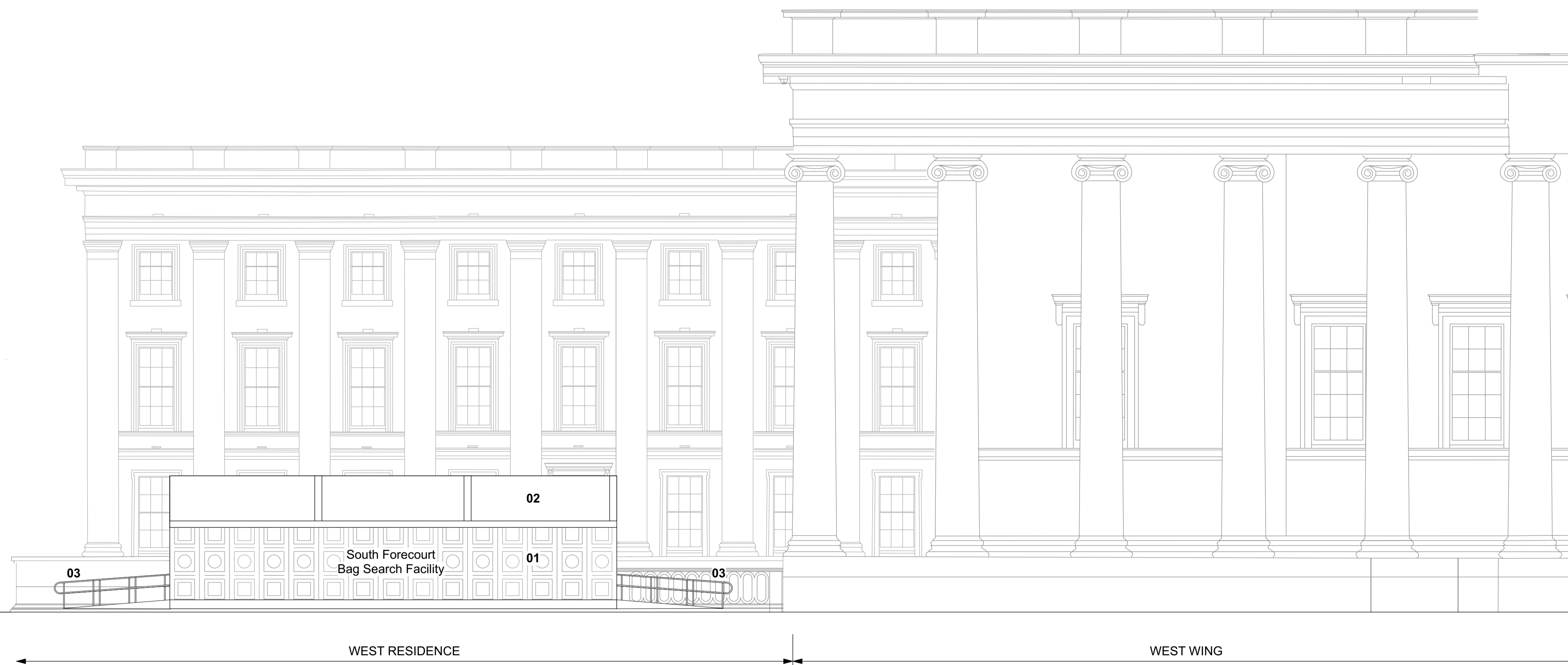
2 East Elevation Scale: 1:100