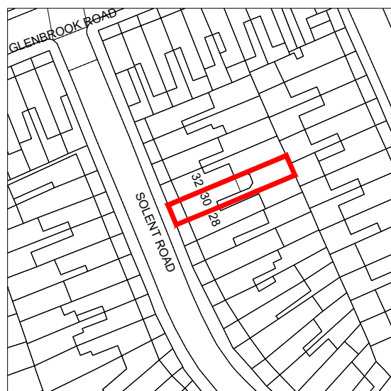
01 Location Plan 1 : 1250 @ A3