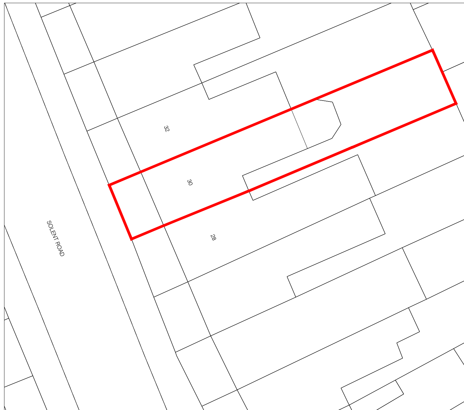
02 Site Plan 1 : 200 @ A3