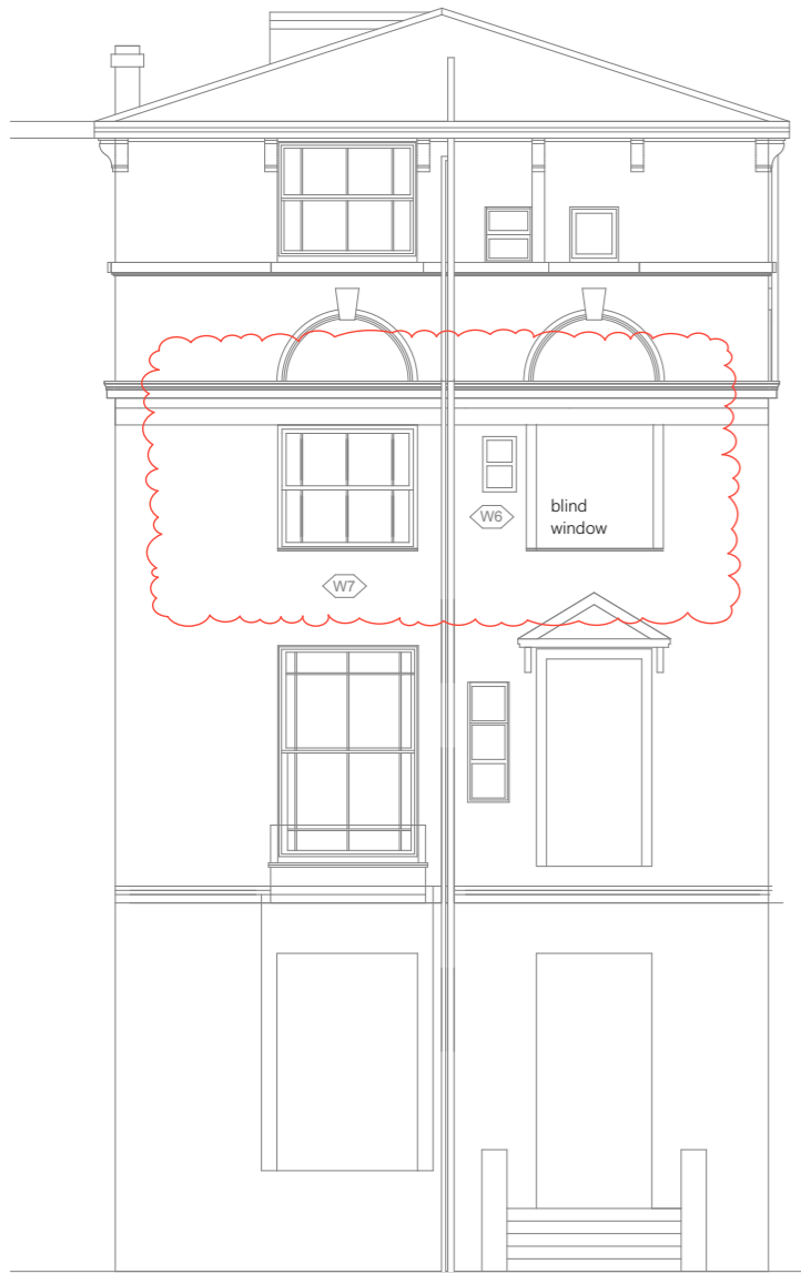
Proposed South - street - Elevation