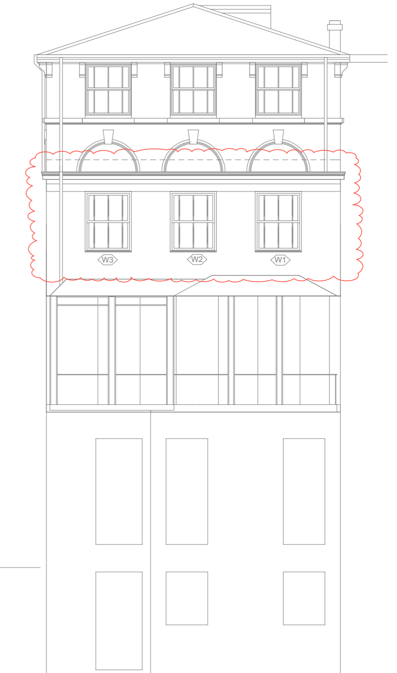
Proposed North - garden - Elevation