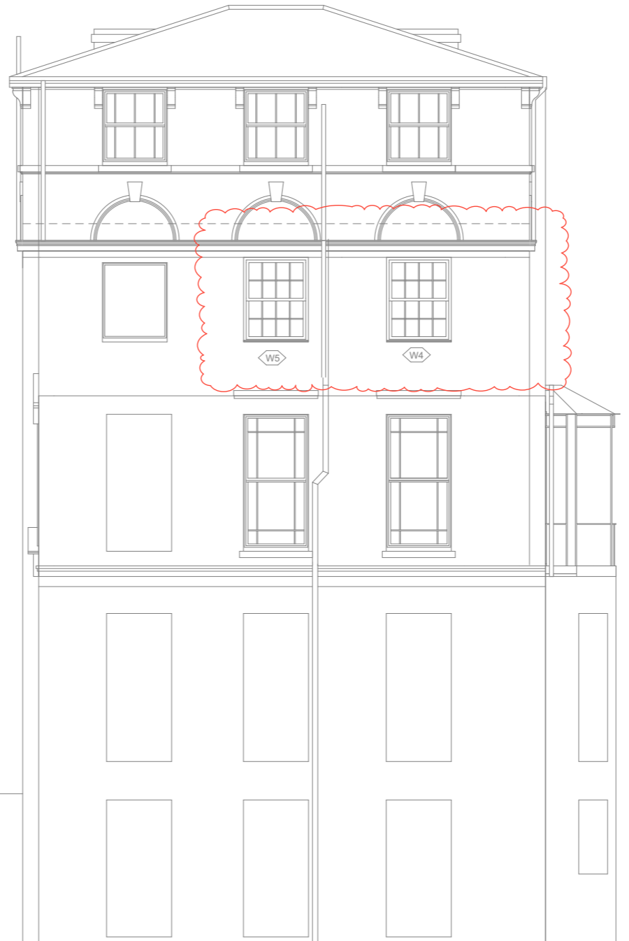
West - canal - Elevation