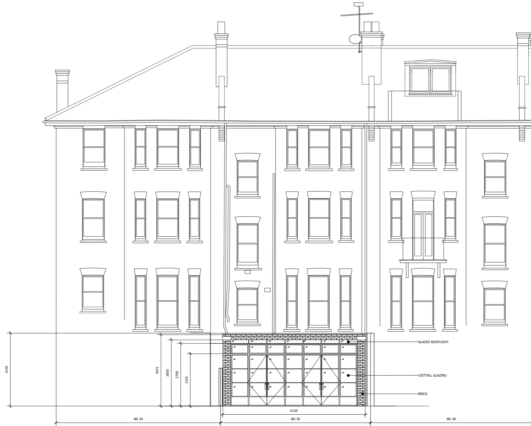
1 ELSWORTHY ROAD - PROPOSED GA ELEVATION Scale: 1:50