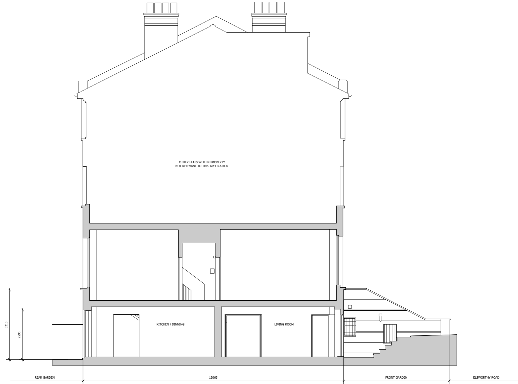
1 ELSWORTHY ROAD - EXISTING GA SECTION Scale: 1:50